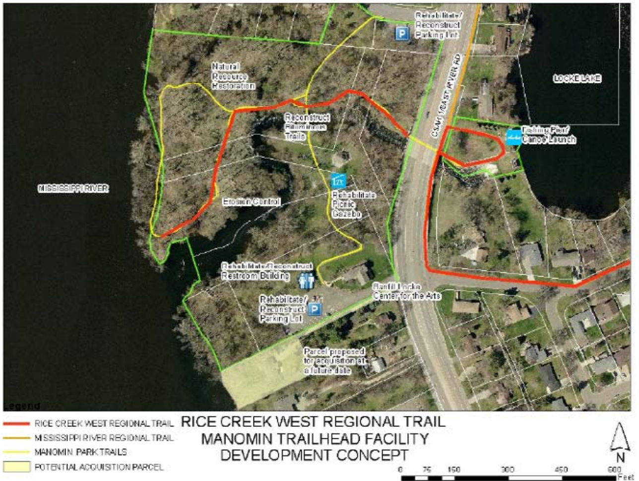
Figure 4: Manomin Trailhead Facility Development Concept

A map depicting the location of facilities and the areas of natural resource restoration is shown in Figure 4: Manomin Trailhead Facility Development Concept