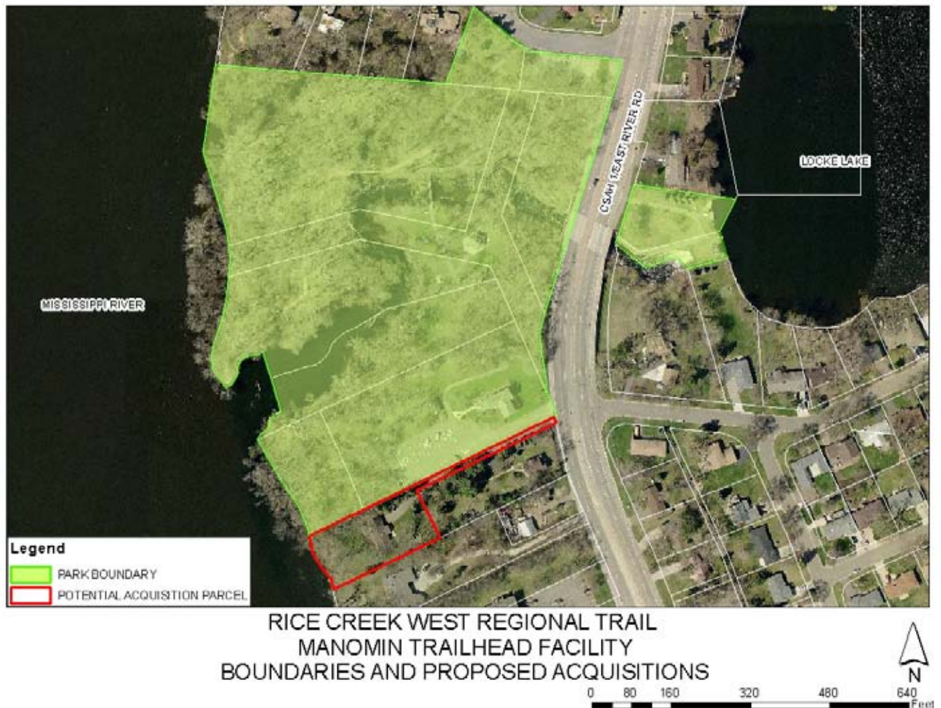
Figure 3: Manomin Trailhead Facility Boundaries and Proposed Acquisition

The parcel is proposed for acquisition because it would provide addition riverfront for the park, would provide additional space for the parking lot and entrance drives to the park and the house would be converted to office space for the Banfill Center for the Arts located in the park. Cost sharing of the acquisition with the entity that operates the art center should be done so that park funds are spent on outdoor recreation purposes.