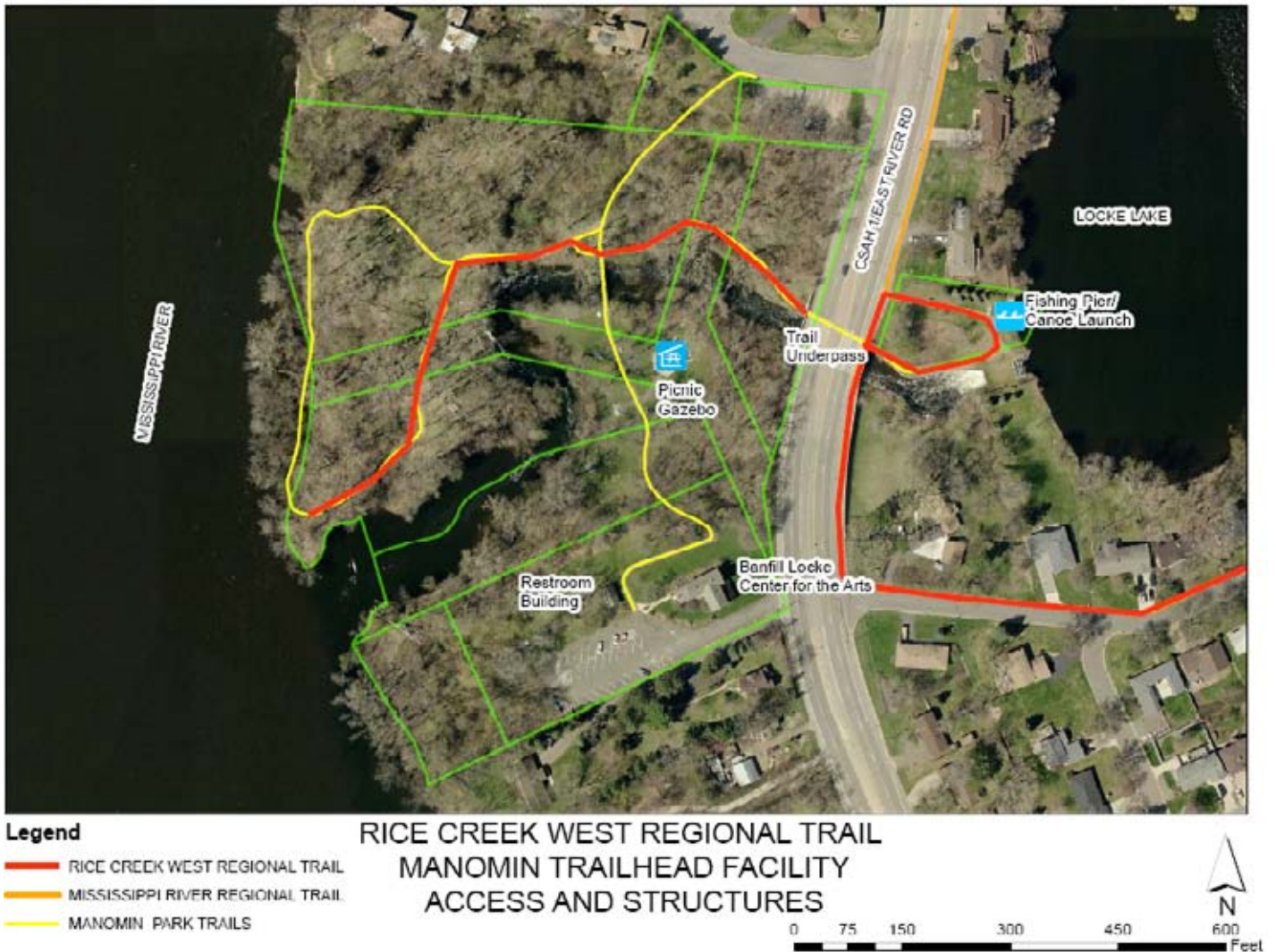
Figure 2: Manomin Trailhead Facility Access and Structures

An aerial map of Manomin Park depicting its current boundary and existing recreational facilities is shown in Figure 2: Manomin Trailhead Facility Access and Structures