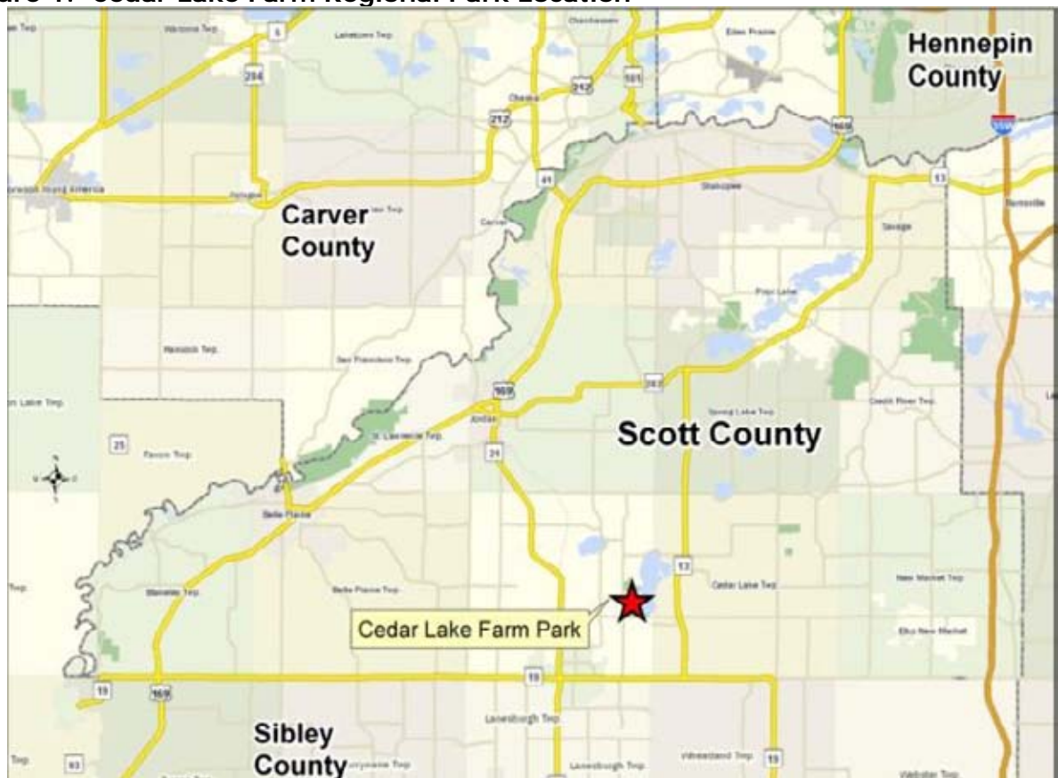
Figure 1: Cedar Lake Farm Regional Park Location