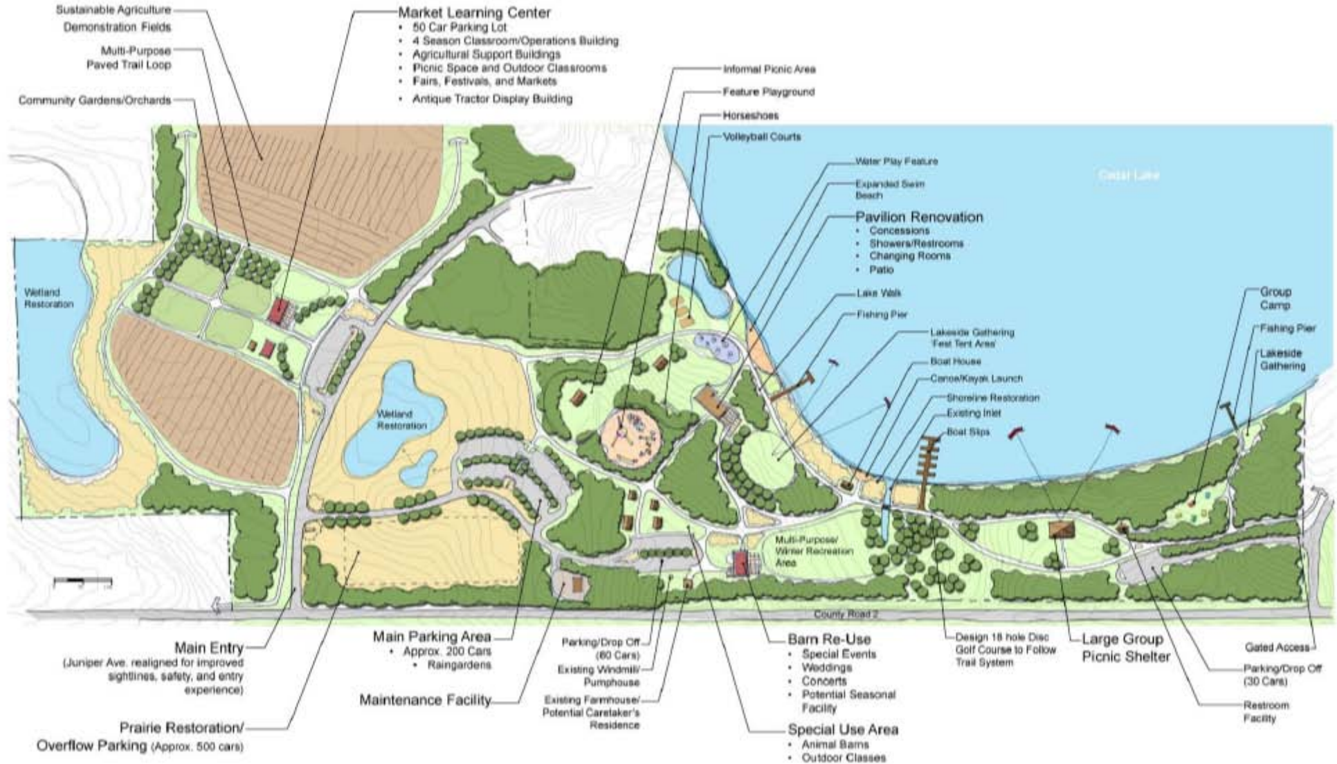
Figure 6: Lakeside Recreation—Cedar Lake Farm Regional Park