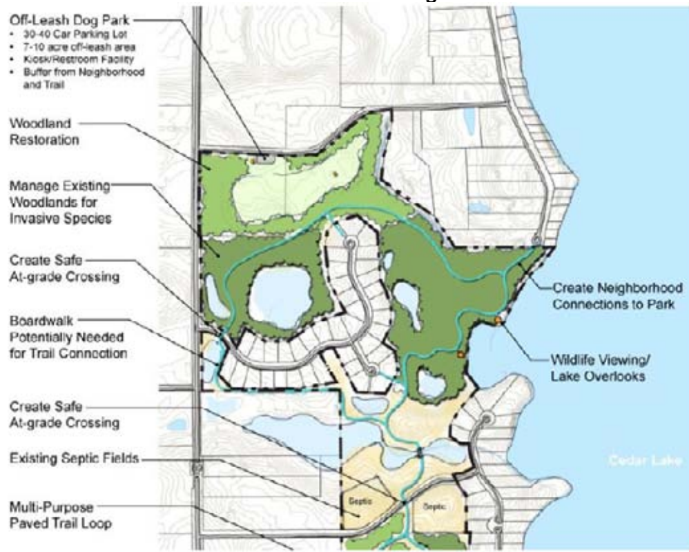
Figure 4: North Woods Area—Cedar Lake Farm Regional Park

Market Learning Center: This area of the park focuses on the theme: “Food from the Soil to the Table” and includes agricultural demonstration field gardens, restored prairie and wetlands, and a paved trail loop. The Market Learning Center activity area will include: