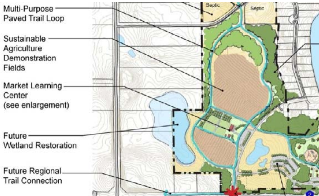
Figure 5: Market Learning Center—Cedar Lake Farm Regional Park

Lakeside Recreation Area: This area includes the main park entrance and the most recreational development of the park. The beach area will be expanded and a splash pad will be provided to offer a water play feature during times of poor water quality at the swimming beach. Two fishing piers are planned—one located in the active use area and one near the group camp site on the east end of the park. A canoe and kayak launch is planned with a boat house for boats that will be rented onsite as well as rental space for privately owned boats. A dock with day-use slips will be provided for park visitors who arrive by boat.