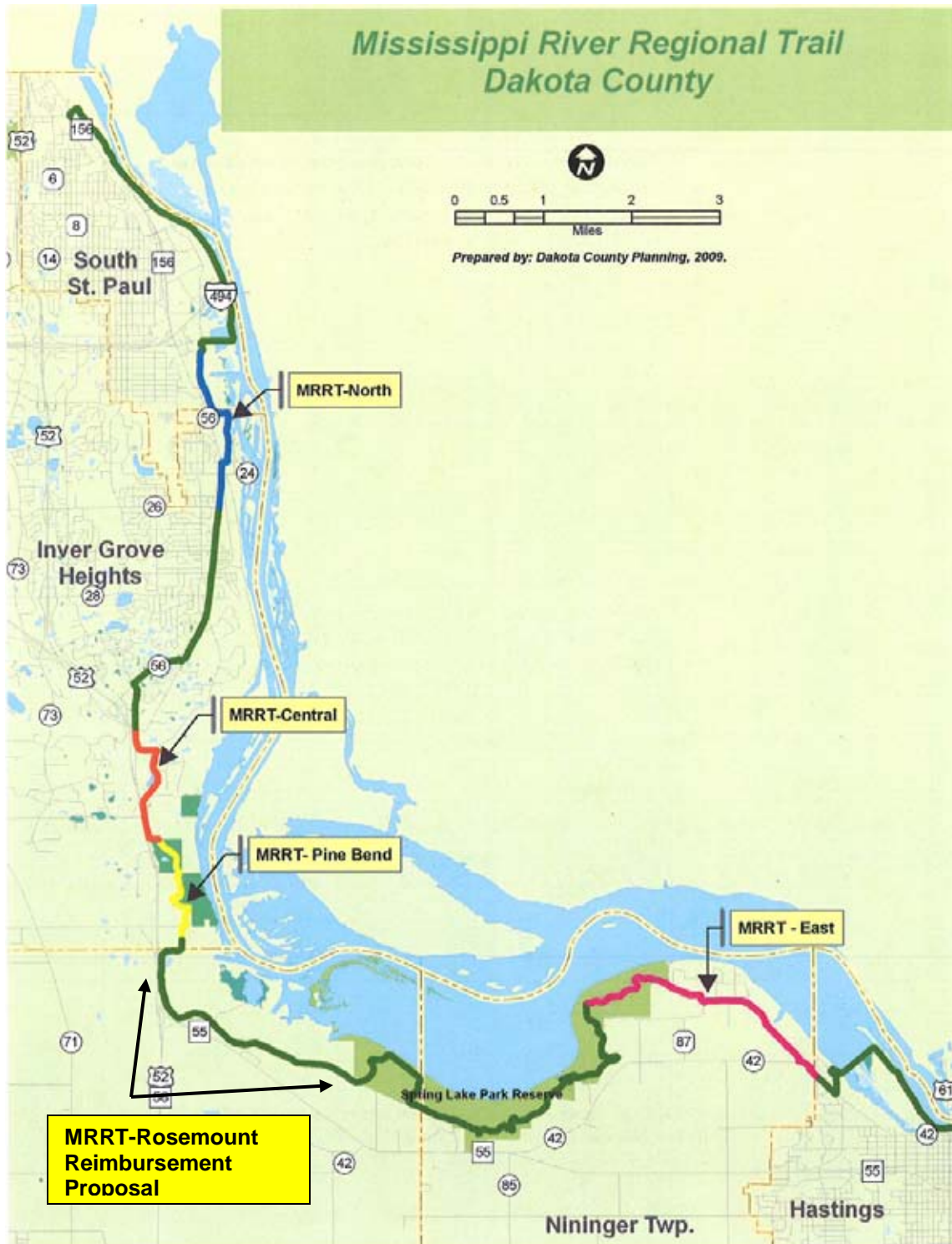
Figure 1: Mississippi River Regional Trail—Dakota County