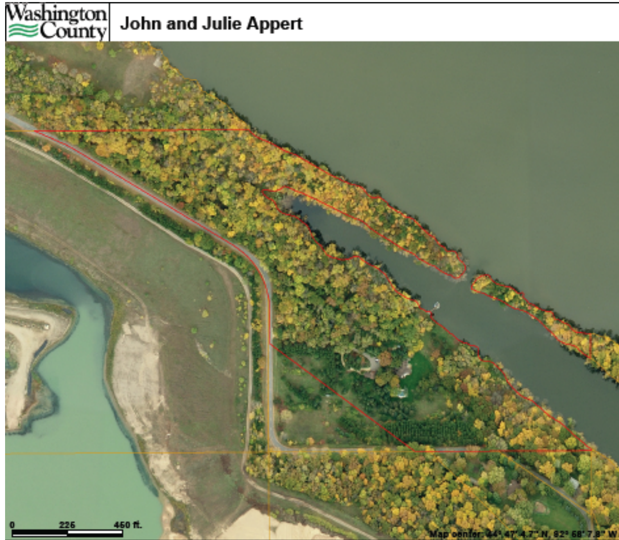
Fig. 2: Appert parcel aerial photograph

Figure 2 is an aerial photograph of the parcel (outlined in red) showing the river shoreline, home and forest cover. .