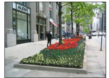
3 CONCEPT FOR PLANTERS ALONG HIAWATHA AVE. 1/4" = 1'-0"