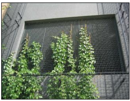
4 GREEN SCREEN MOUNTED TO BUILDING FACADE 1/4" = 1'-0"