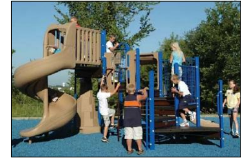
5 PLAYSENSE 403, PLAY STRUCTURE 1/4" = 1'-0"