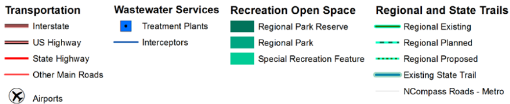
Figure 2: Dakota County Transportation System 2011