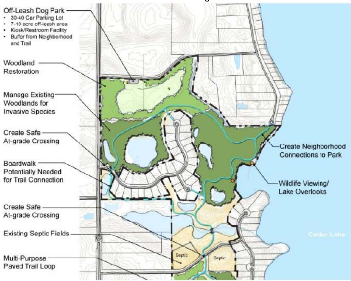
Figure 4: North Woods Area—Cedar Lake Farm Regional Park

Market Learning Center: This area of the park focuses on the theme: “Food from the Soil to the Table” and includes agricultural demonstration field gardens, restored prairie and wetlands, and a paved trail loop. The Market Learning Center activity area will include: gardens; orchards; outdoor classrooms; picnic space; as well as a four-season classroom and operations building, which will offer year-round programming as well as food preparation and cooking instruction facilities. Open space around the gardens and building will be used for farmers markets, fairs and festivals.