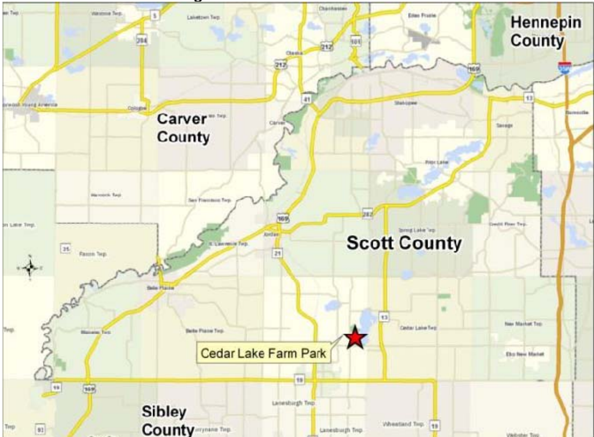
Figure 1: Cedar Lake Farm Regional Park Location