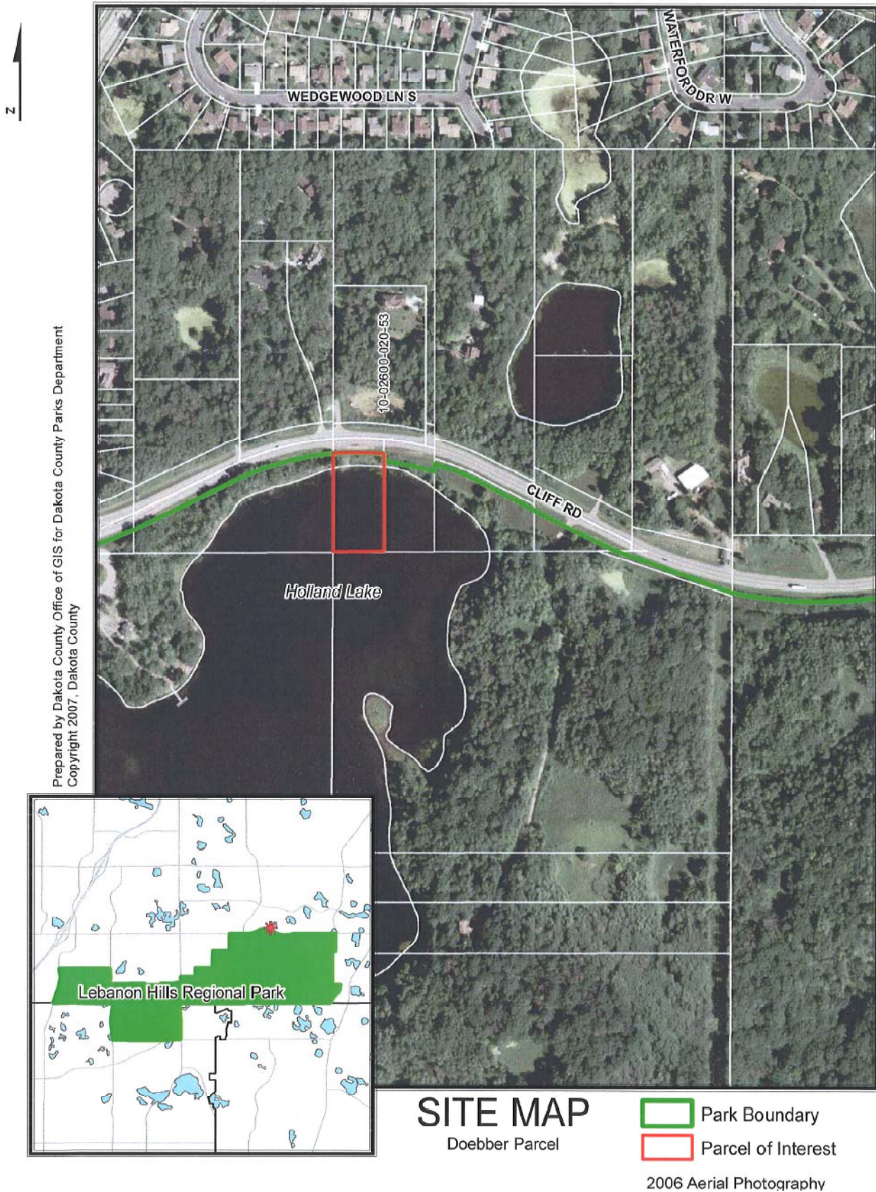
Figure 1: Aerial photo and map of 1.4 acre (Doebber) parcel for Lebanon Hills Regional Park, Dakota County