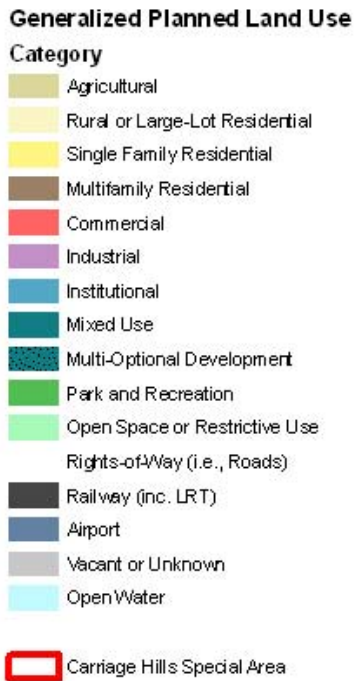
Figure 1a. Carriage Hills Special Area Generalized Planned Land Use, City of Eagan