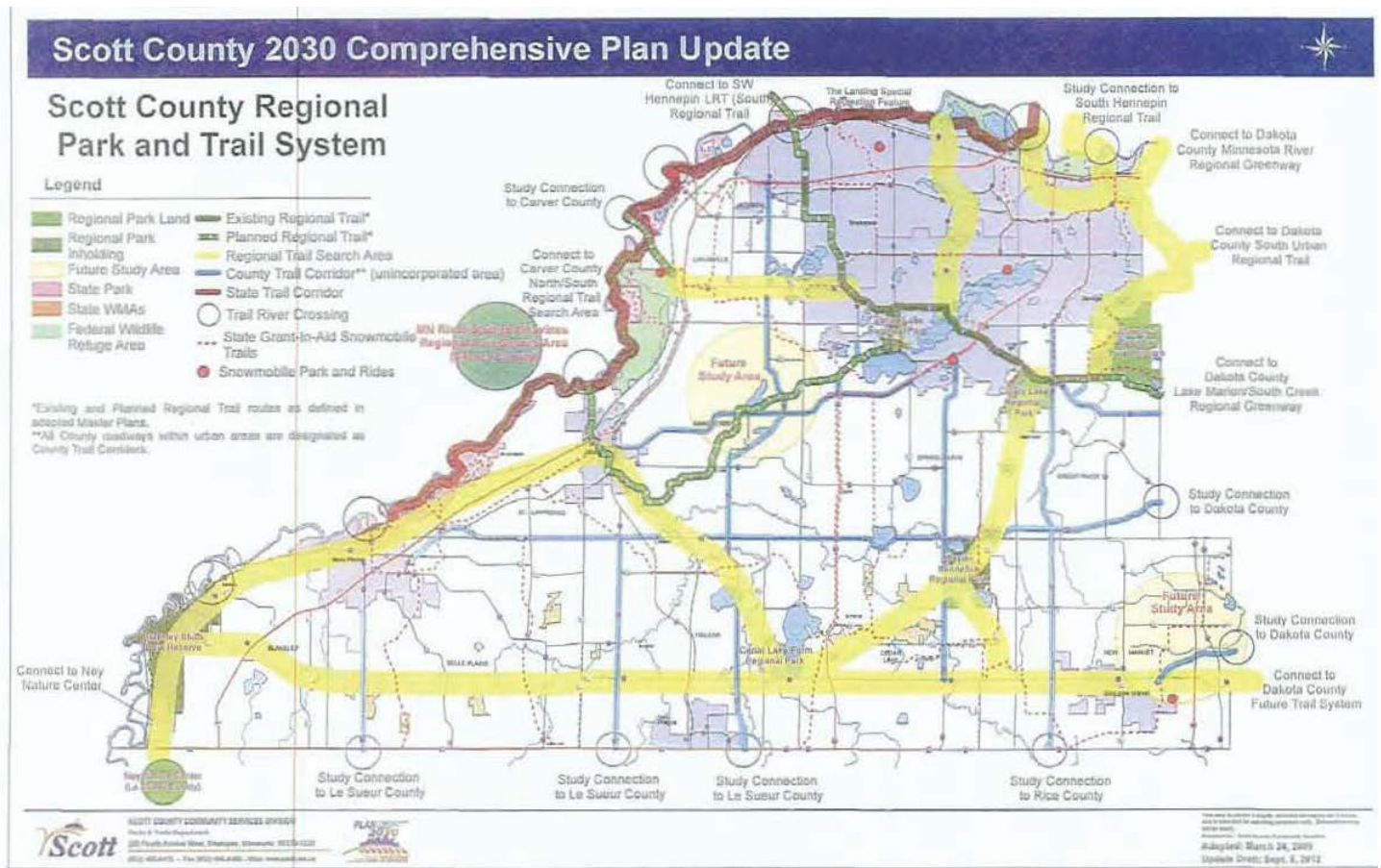
Figure 1: Scott County's Updated Planned Parks and Trails Map