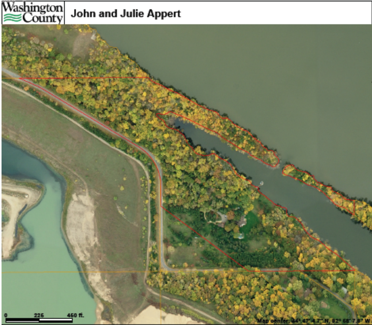
Fig. 2: Appert parcel aerial photograph

Figure 2 is an aerial photograph of the parcel (outlined in red) showing the river shoreline, home and forest cover. .