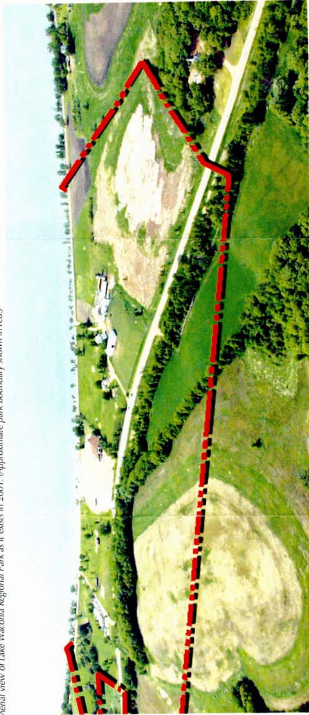
Aerial view of Lake Waconia Regional Park as it exists in 2001. (Approximate park boundary shown in red.)

As the aerial illustrates, much of the land has been either developed or used for agricultural purposes over the last 40 or more years. Under this master plan, virtually the entire site will be either redeveloped for recreational use or restored to natural ecological systems.