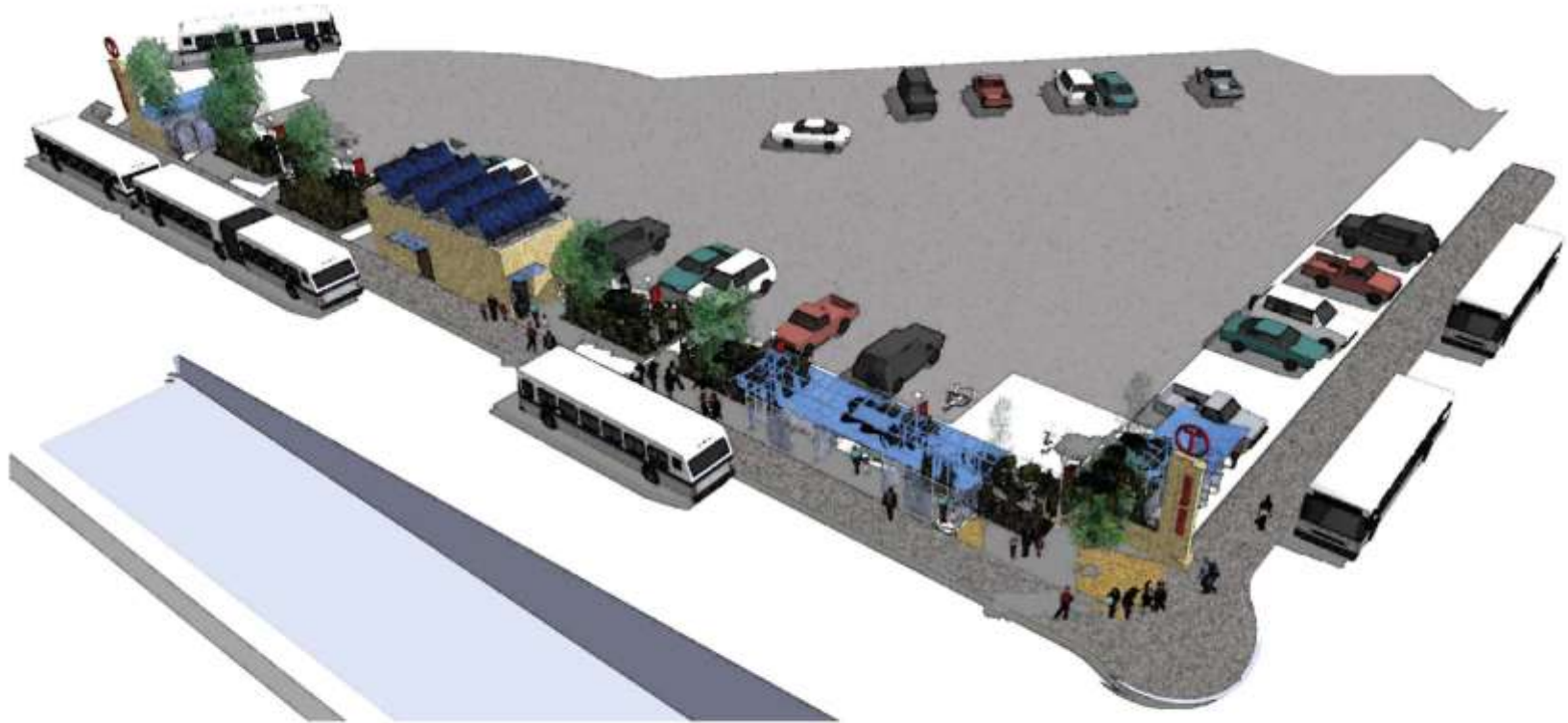
Transit Center Illustrative Perspective VIEW LOOKING NORTHEAST