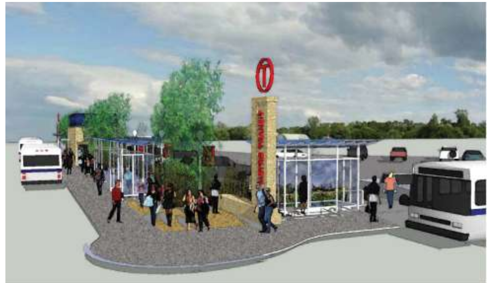
Transit Center Illustrative Perspective