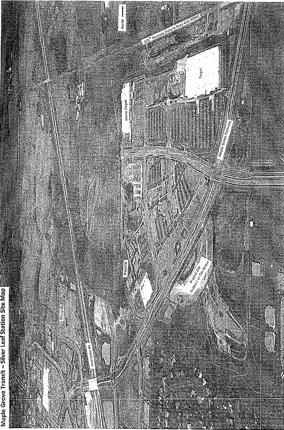
Maple Grove Transit – Silver Leaf Station Site Map