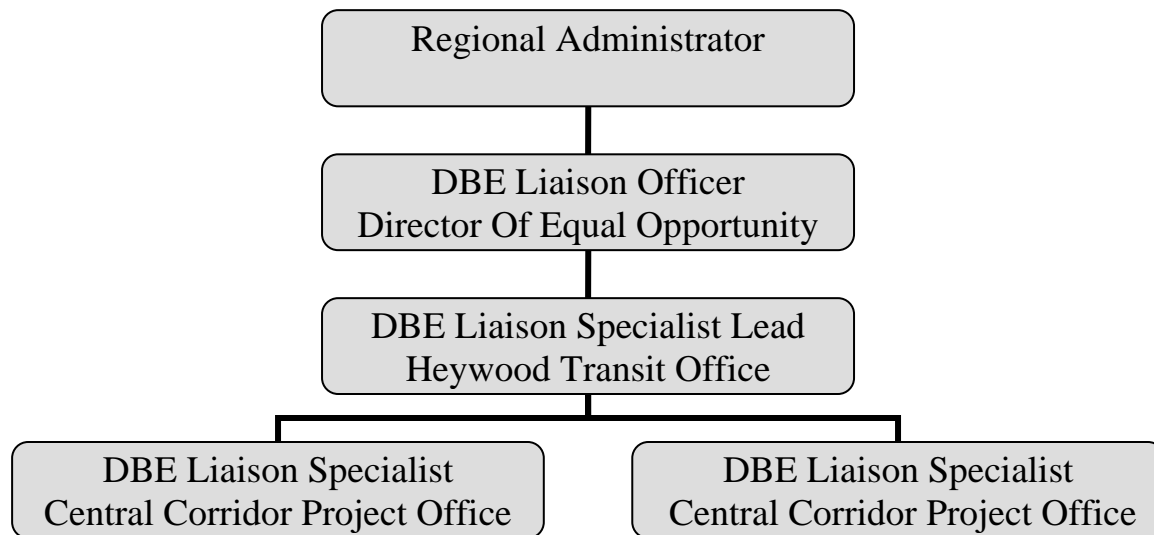
Figure 1: DBE Organizational Chart

The DBE Liaison Officer is responsible for developing, coordinating, and monitoring the implementation of the Council’s DBE program on a day-to-day basis. Implementation of the DBE program has the same priority as compliance with all other legal obligations incurred by the Council in its financial assistance agreements with USDOT.