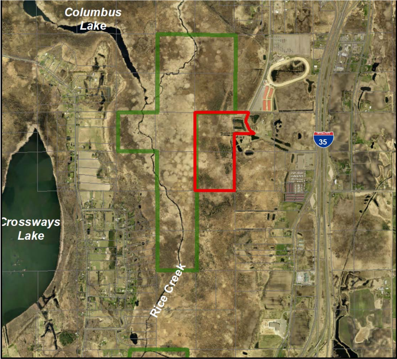
Figure 1: Aerial map of 85 acre Preiner parcel in Rice Creek Chain of Lakes Park Reserve