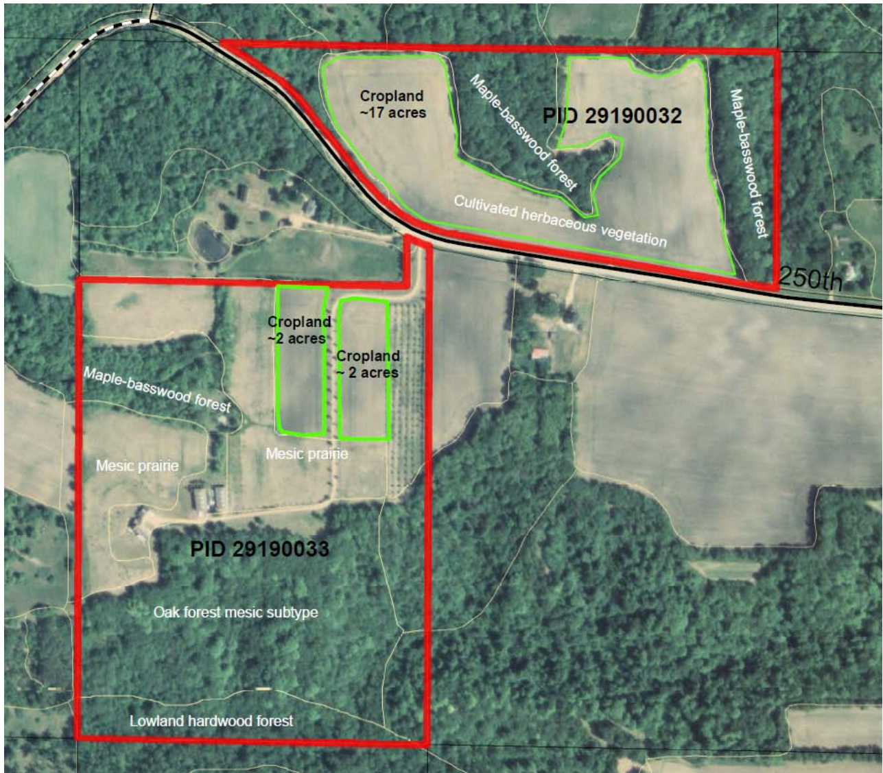
Figure 2: Wells Fargo parcels showing existing vegetation on the land

Figure 2 depicts the parcels (2) in more detail showing existing vegetation on the land.