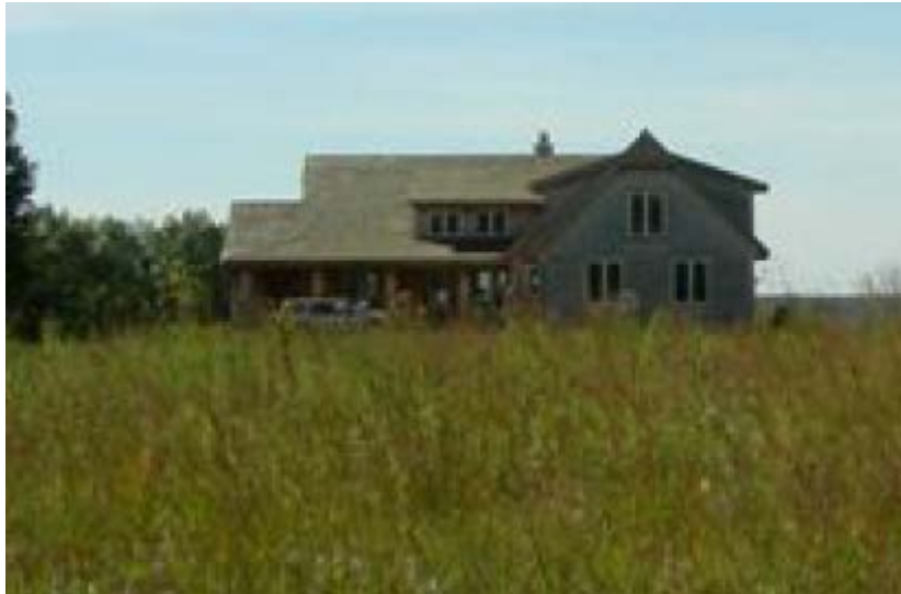
Figure 3: House and pole barns on Wells Fargo parcel

The acquisition includes a 3,955 sq. ft. 3 bedroom, 3 bath, 3 car garage home and two 40 ft. by 80 ft. pole barns as shown in Figure 3 below. These structures will initially be rented until the park is developed in the future and then reused for park purposes.