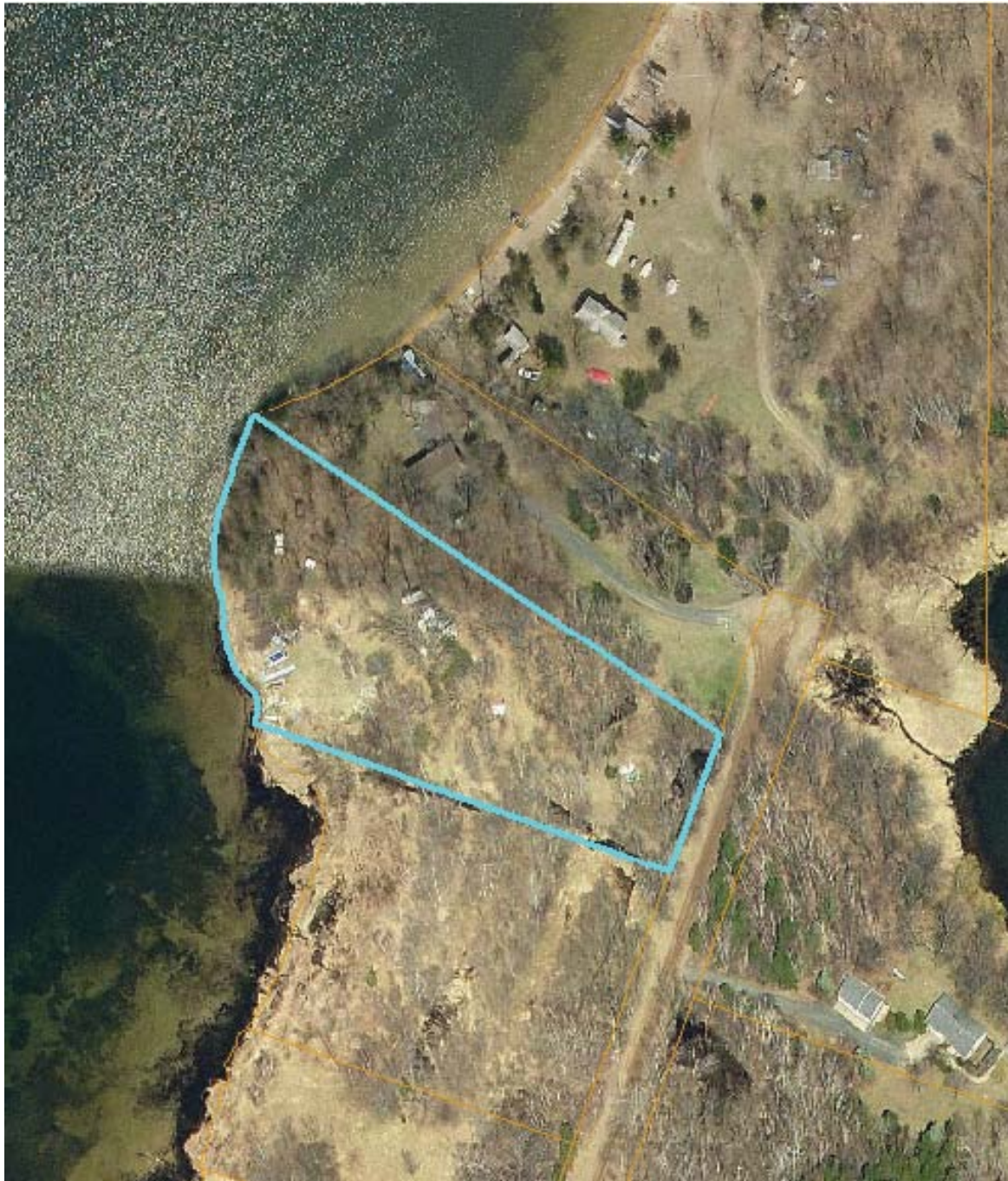
Figure 1: Aerial map of Knauff parcel

Figure 2 illustrates the parcel in the context of the park's acquisition plan. It is an "A high priority" parcel.