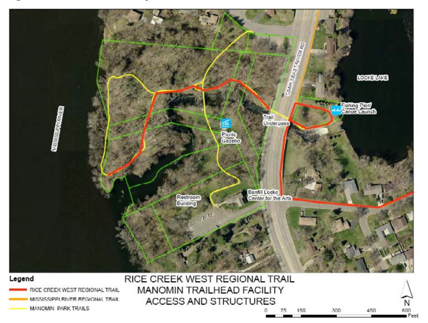
Figure 2: Manomin Trailhead Facility Access and Structures

An aerial map of Manomin Park depicting its current boundary and existing recreational facilities is shown in Figure 2: Manomin Trailhead Facility Access and Structures