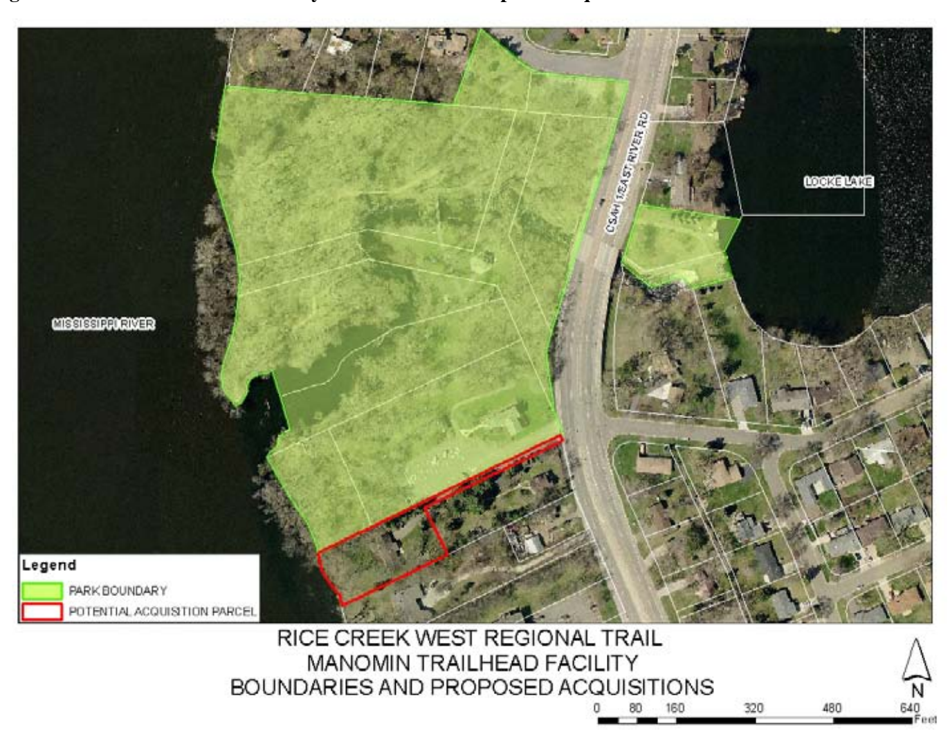
Figure 3: Manomin Trailhead Facility Boundaries and Proposed Acquisition

The parcel is proposed for acquisition because it would provide addition riverfront for the park, would provide additional space for the parking lot and entrance drives to the park and the house would be converted to office space for the Banfill Center for the Arts located in the park. Cost sharing of the acquisition with the entity that operates the art center should be done so that park funds are spent on outdoor recreation purposes.