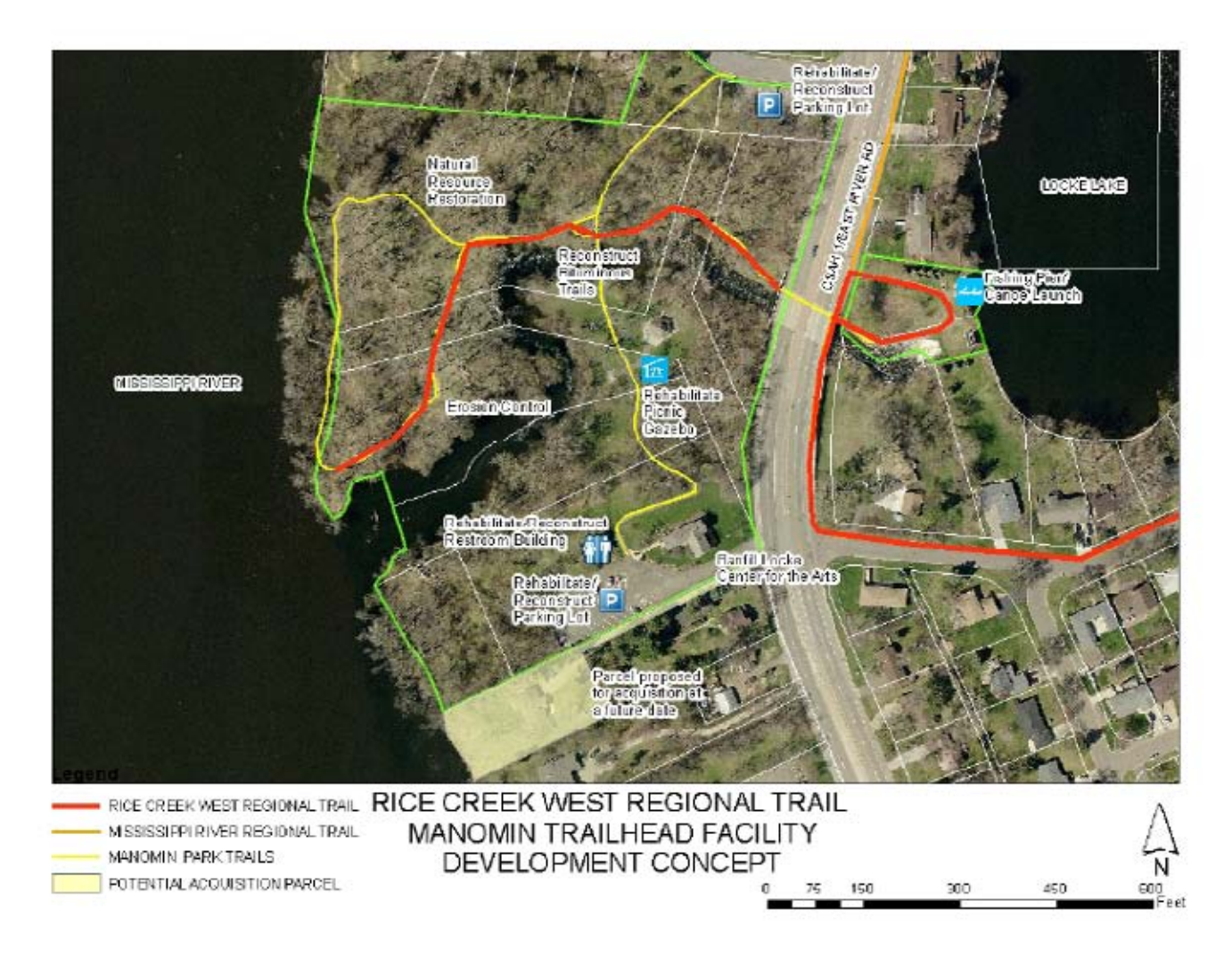
Figure 4: Manomin Trailhead Facility Development Concept

A map depicting the location of facilities and the areas of natural resource restoration is shown in Figure 4: Manomin Trailhead Facility Development Concept