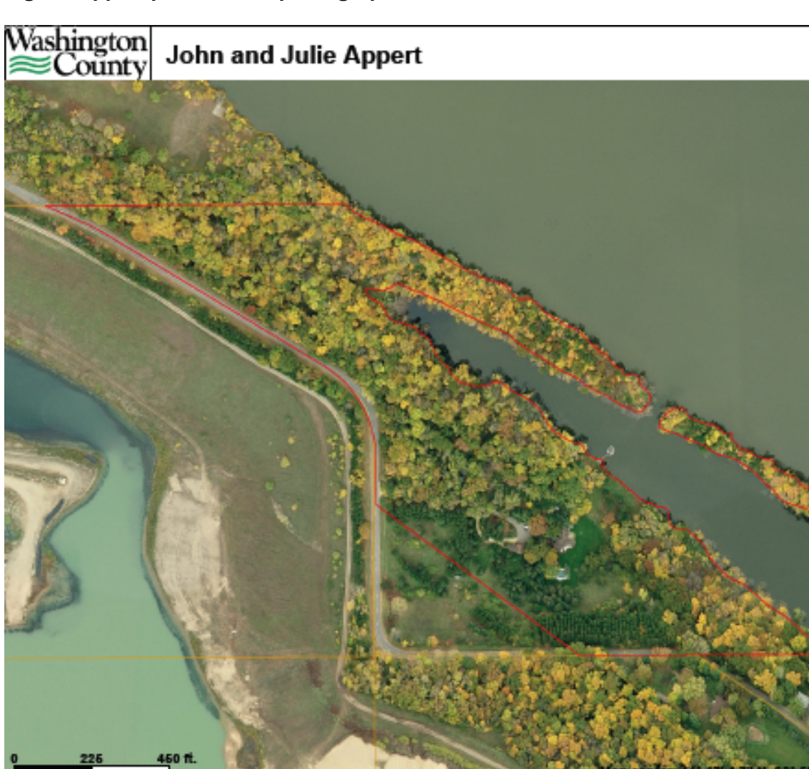
Fig. 2: Appert parcel aerial photograph

Figure 2 is an aerial photograph of the parcel (outlined in red) showing the river shoreline, home and forest cover.