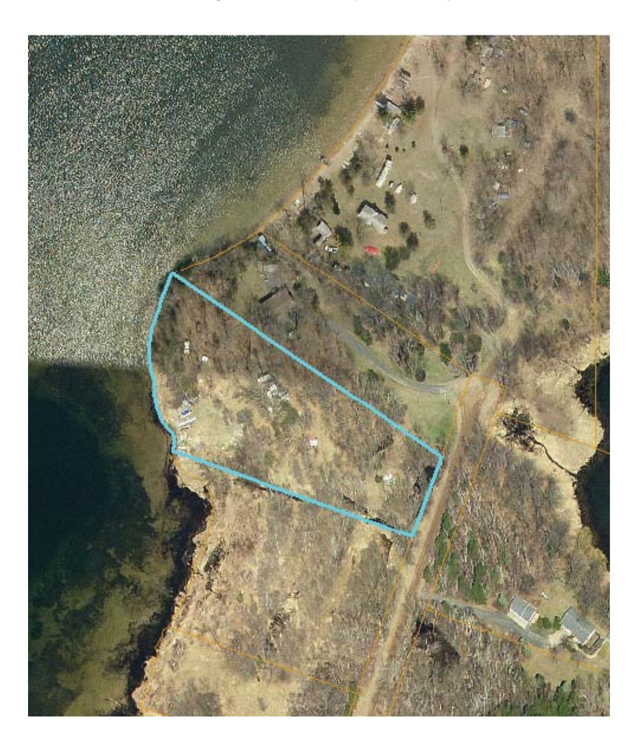
Figure 2 illustrates the parcel in the context of the park's acquisition plan. It is an "A high priority" parcel.