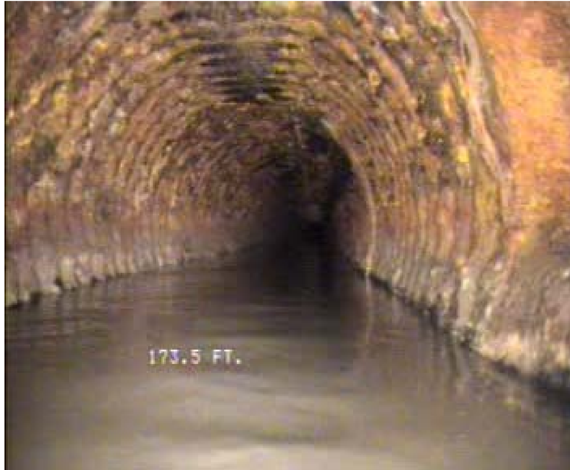
Photo: Corrosion damage to corrugated metal pipe