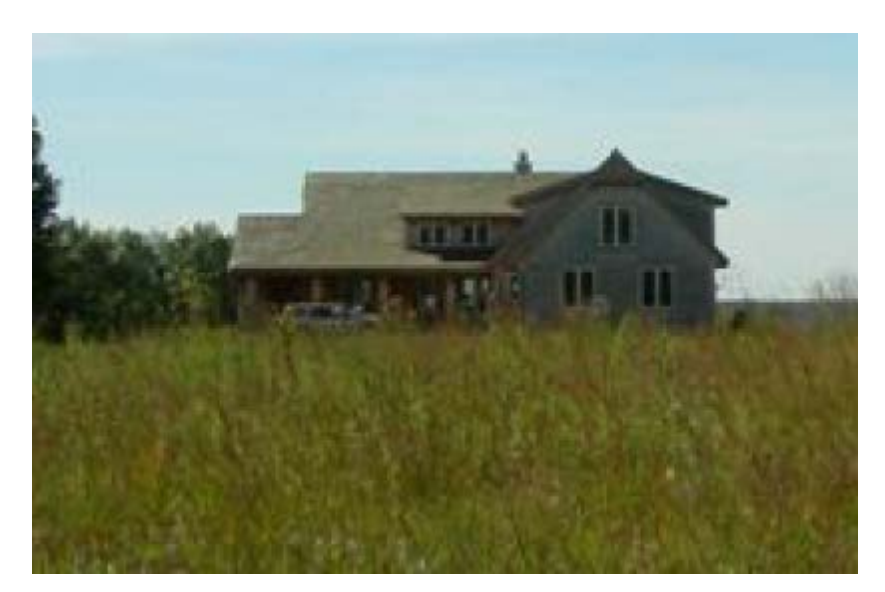
Figure 3: House and pole barns on Wells Fargo parcel

The acquisition includes a 3,955 sq. ft. 3 bedroom, 3 bath, 3 car garage home and two 40 ft. by 80 ft. pole barns as shown in Figure 3 below. These structures will initially be rented until the park is developed in the future and then reused for park purposes.