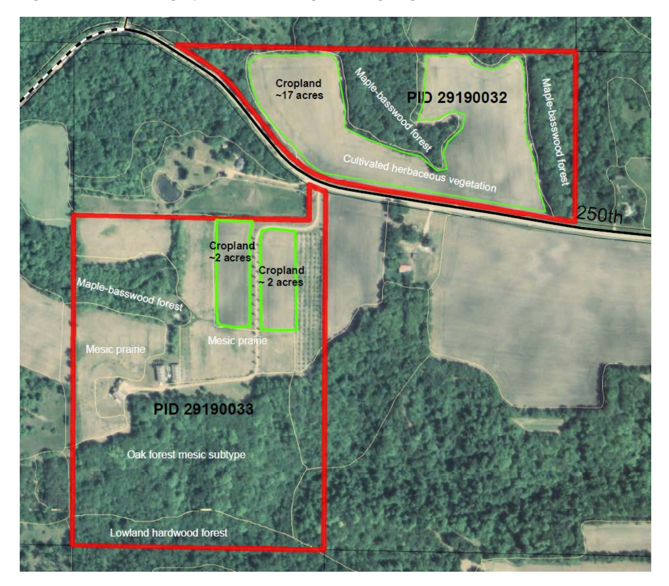
Figure 2: Wells Fargo parcels showing existing vegetation on the land

Figure 2 depicts the parcels (2) in more detail showing existing vegetation on the land.