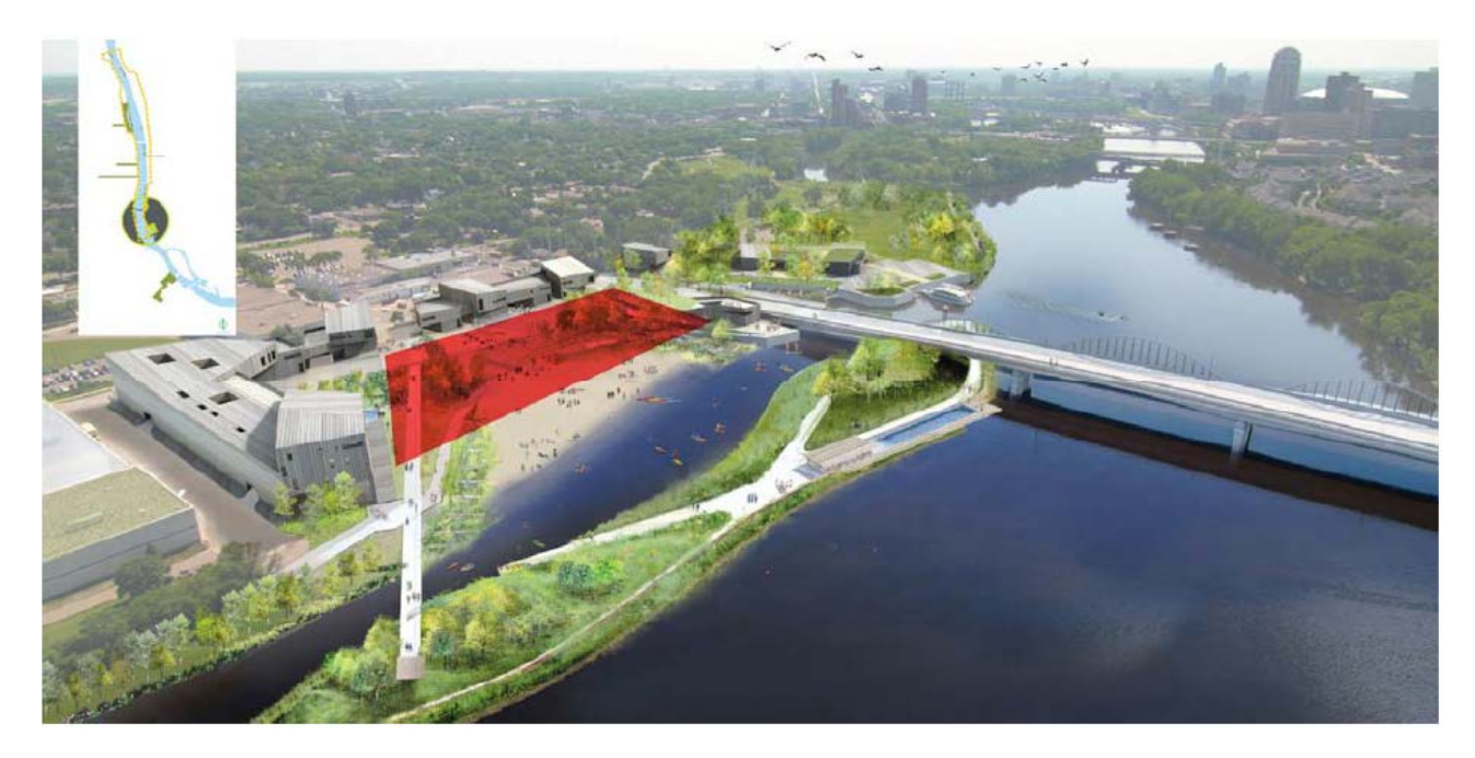
Figure 3: Artists' rendering design for Scherer Lumber Company site in Above the Falls Regional Park

The estimated cost to develop this portion of Above the Falls Regional Park is $23.3 million as shown in Table 3. It should be noted that re-creating Hall's Island accounts for $10 to $12 million of the total cost. The costs will be refined further in the updated master plan for the entire Above the Falls Regional Park and through schematic design, and permit scoping for specific projects. The updated master plan is expected to be completed in early 2013.