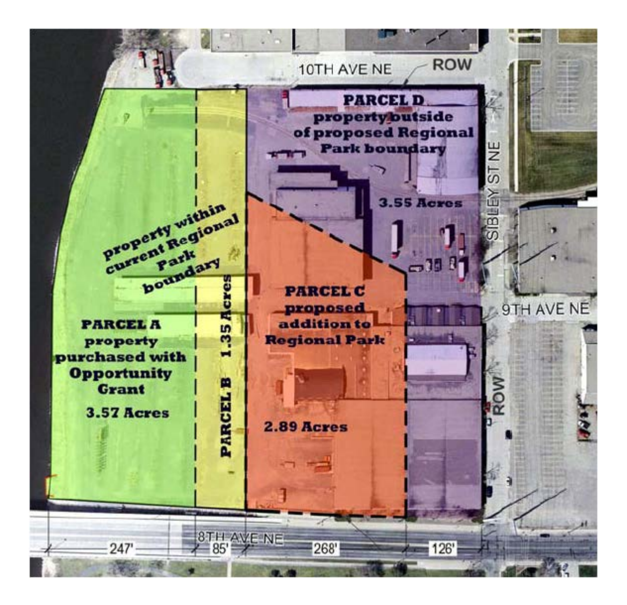
Figure 2: Scherer Lumber Co. Parcel in Context of Existing and Amended Boundary for Above the Falls Regional Park

Figure 2 illustrates more details on land that is within the current boundary and the amended boundary. A portion of the land within the current boundary (Parcel A, 3.57 acres) was financed with a 2010 Park Acquisition Opportunity Fund grant and match provided by the Minneapolis Park & Rec. Board. Parcel B, 1.35 acres is also within the park's current boundary. Parcel C, 2.89 acres is proposed to added to the park. Parcel D, 3.55 acres will remain outside the park's boundary.