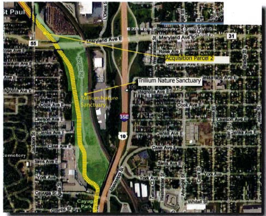
Figure D: Acquisition Parcel 2, Trillium Nature Sanctuary Site

Estimated acquisition cost is $2,350,000.