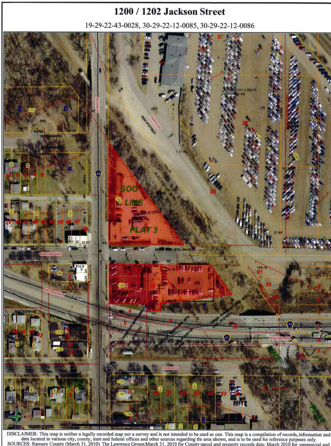
Figure 2: Aerial Photo of Proposed Acquisition “1200/1202 Jackson Street”:

Figure 2 is an aerial photo of the proposed acquisition titled “1200/1202 Jackson Street”. There are three distinct parcels proposed to be acquired. The land that separates them is a vacated street and is already in public ownership.