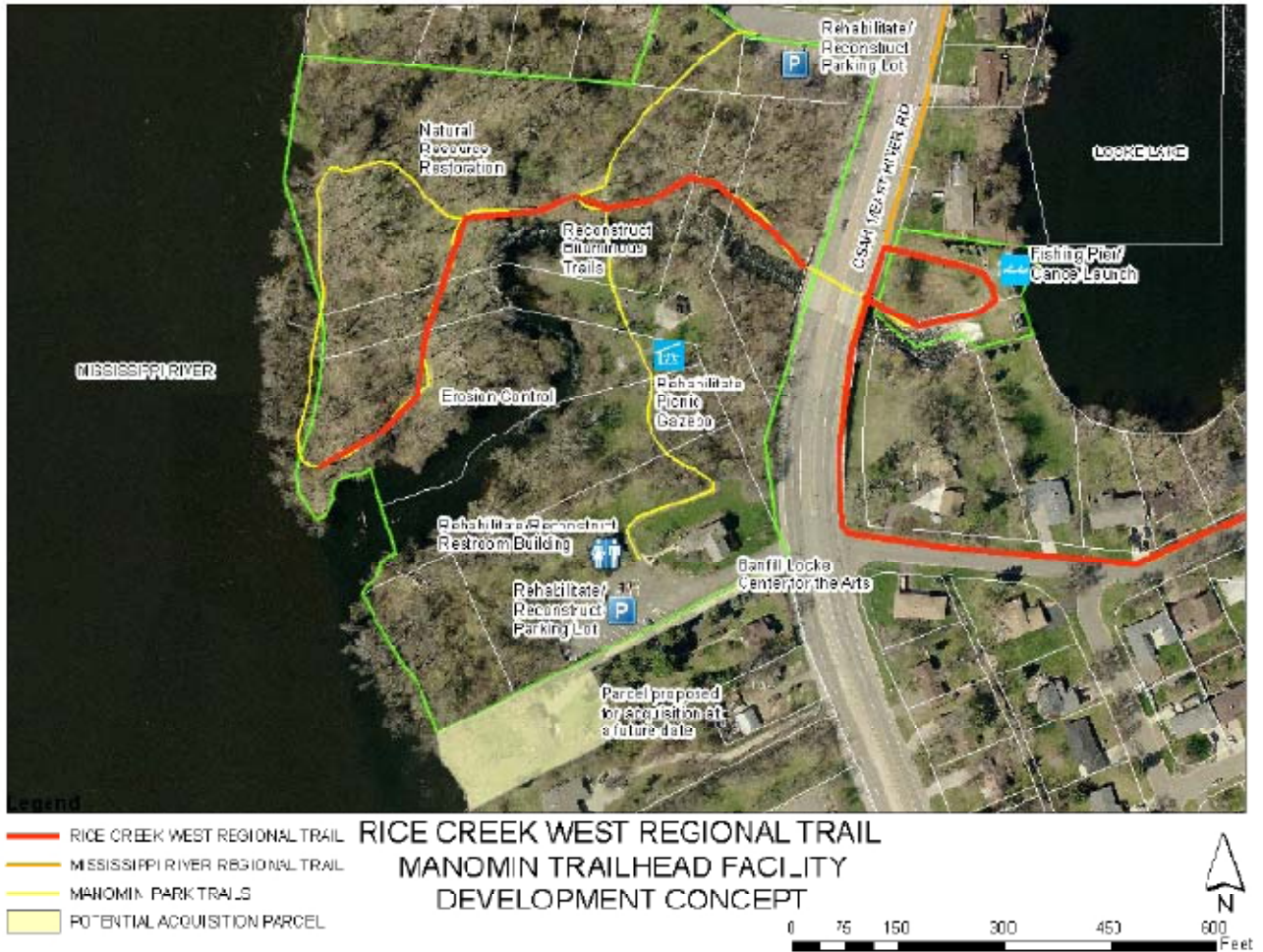
Figure 4: Manomin Trailhead Facility Development Concept

A map depicting the location of facilities and the areas of natural resource restoration is shown in Figure 4: Manomin Trailhead Facility Development Concept