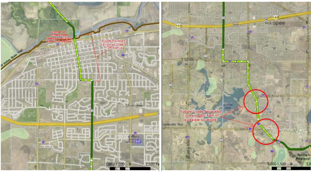
Segment 3: Spring Lake RP to Cleary Lake RP