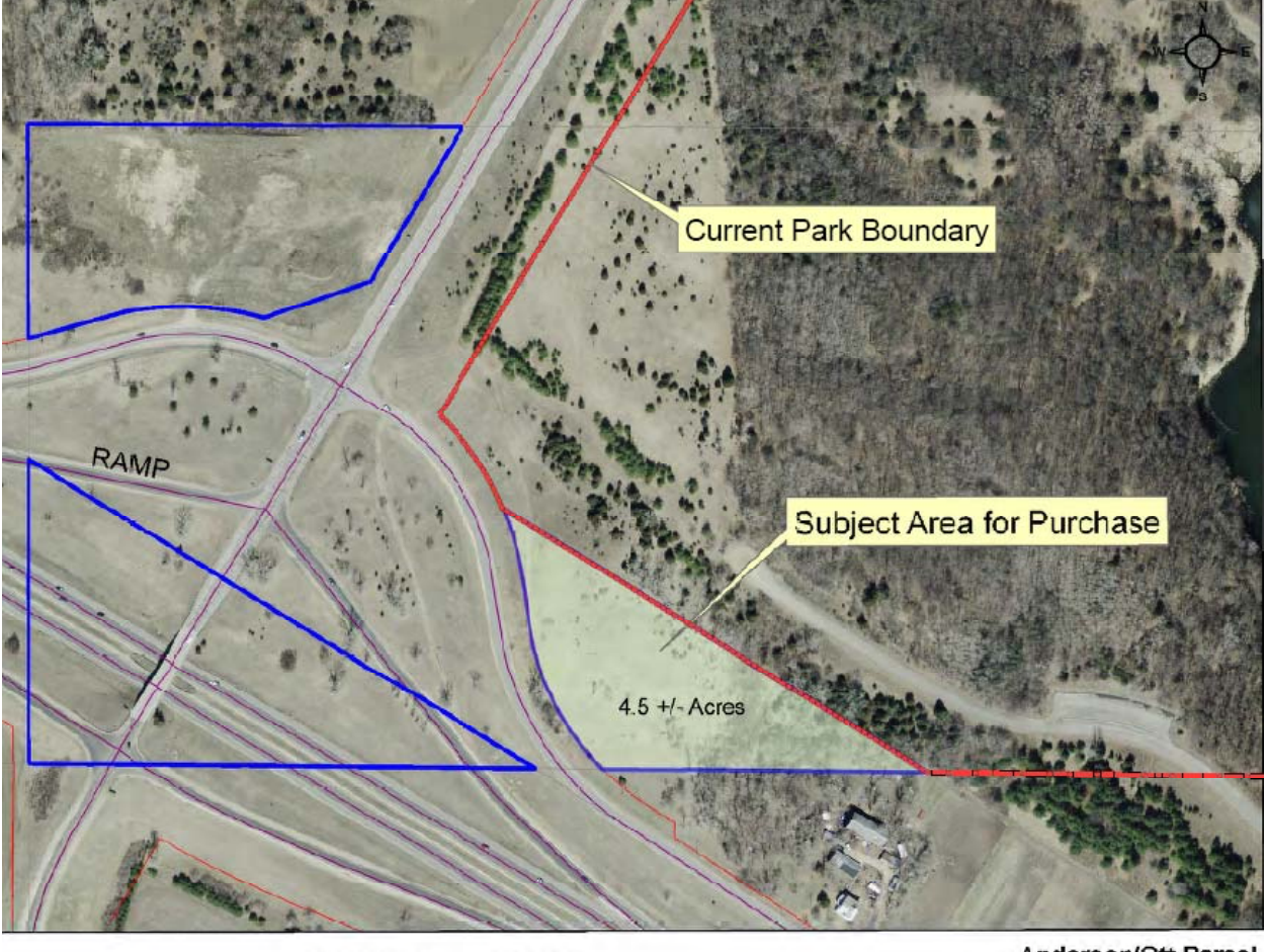
Figure 2: Anderson property proposed for park acquisition

Figure 2 illustrates the Anderson property at a larger scale. The 4.86 acres proposed for acquisition is adjacent to existing park land. The other areas outlined in blue are not part of this acquisition proposal.