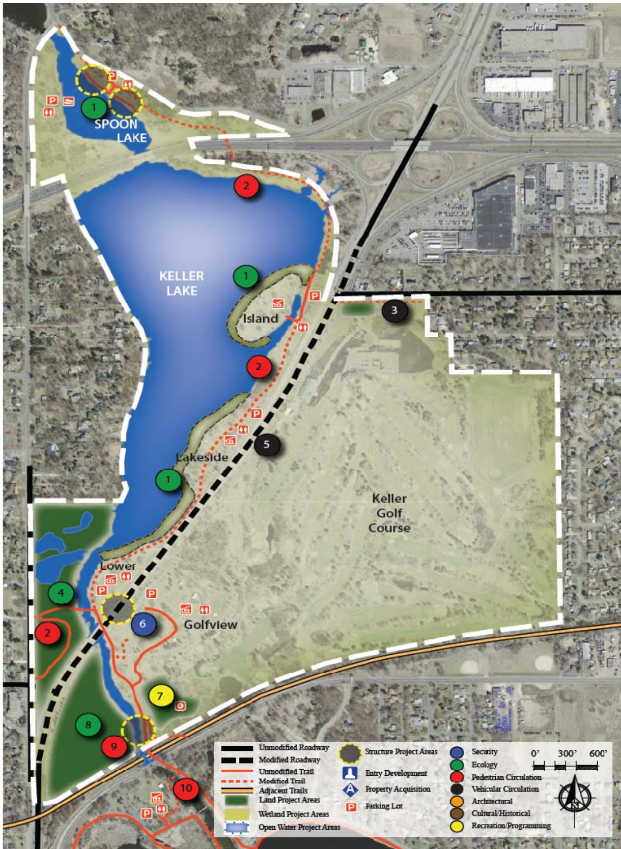
Figure 1: Keller Park Site Plan (Numbers correspond to development projects listed on page )