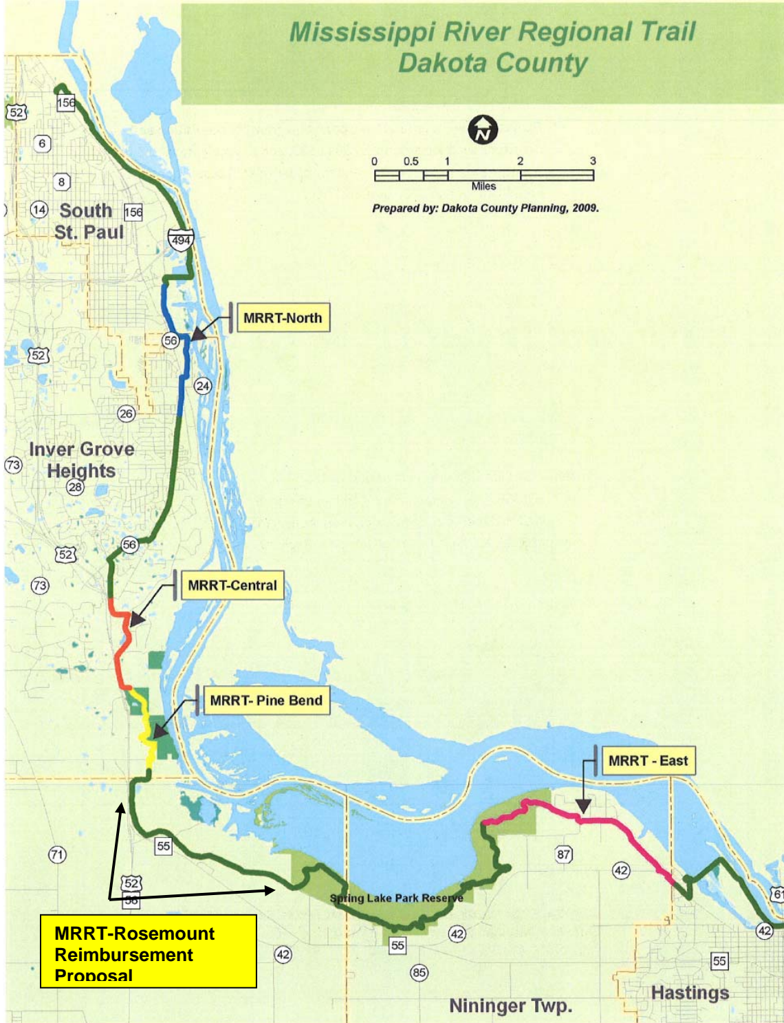
Figure 1: Mississippi River Regional Trail—Dakota County

In April 1997, the Metropolitan Council approved the master plan for the North Urban Regional Trail (NURT)—Referral No. 16366-1. The master plan called for construction of a portion of the trail within the Dodge Nature Center including the acquisition of 3 acres needed for the trail right of way. To-date the