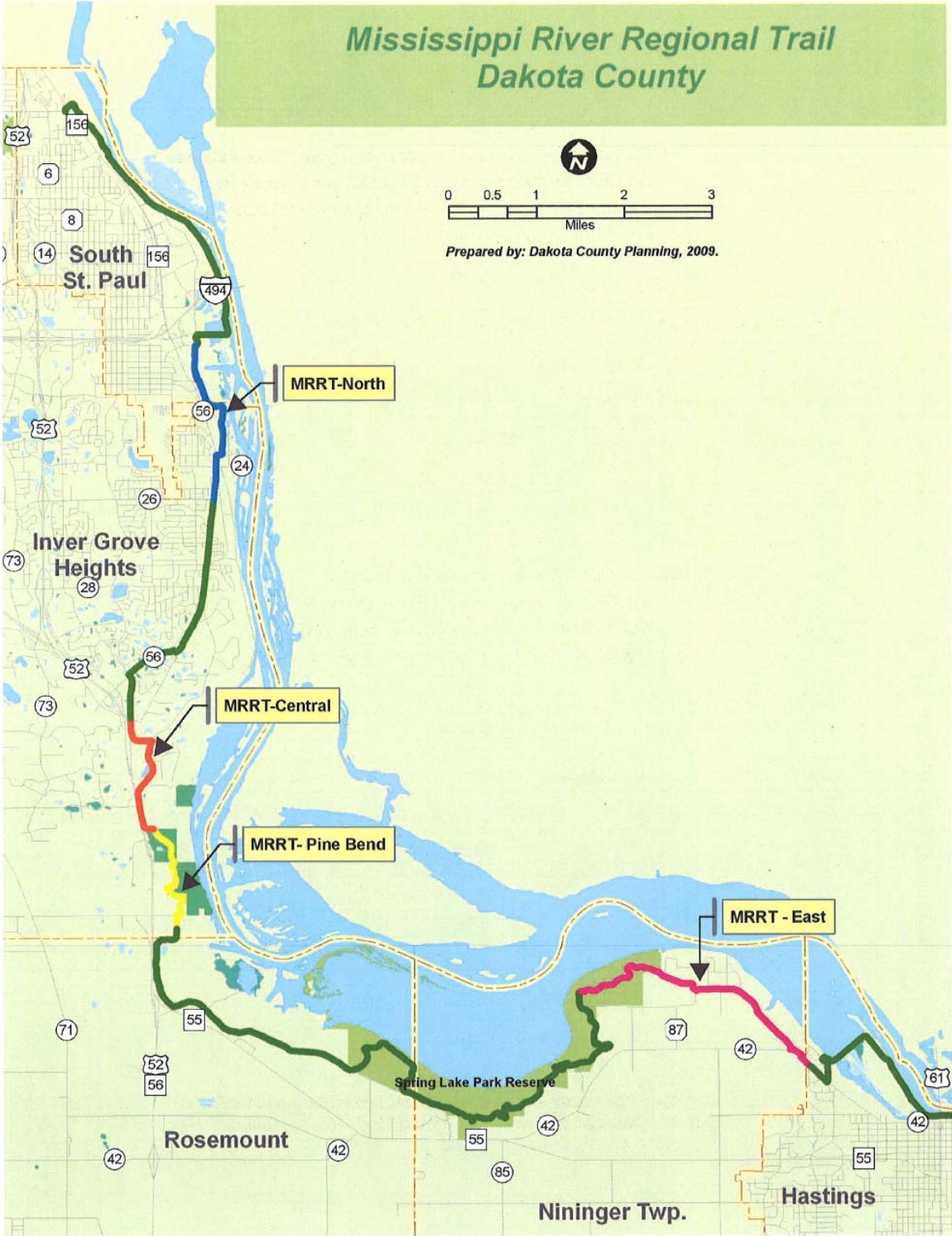
Figure 1: Mississippi River Regional Trail—Dakota County

The Metropolitan Council approved an updated master plan for Spring Lake Park Reserve in April 2004. That plan included the development of the Schaar’s Bluff Gathering Center. The center has been built. The County’s