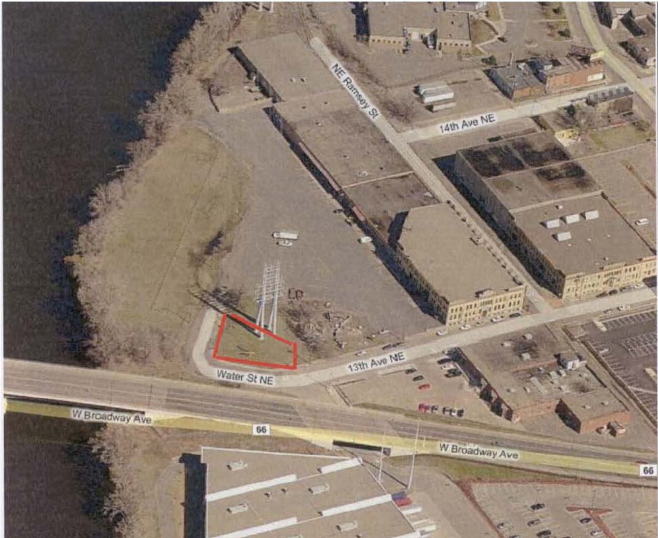
Figure 2: 9/15 13 th Ave. NE parcels to be donated

Photos of the parcels are shown in Figures 2 and 3.