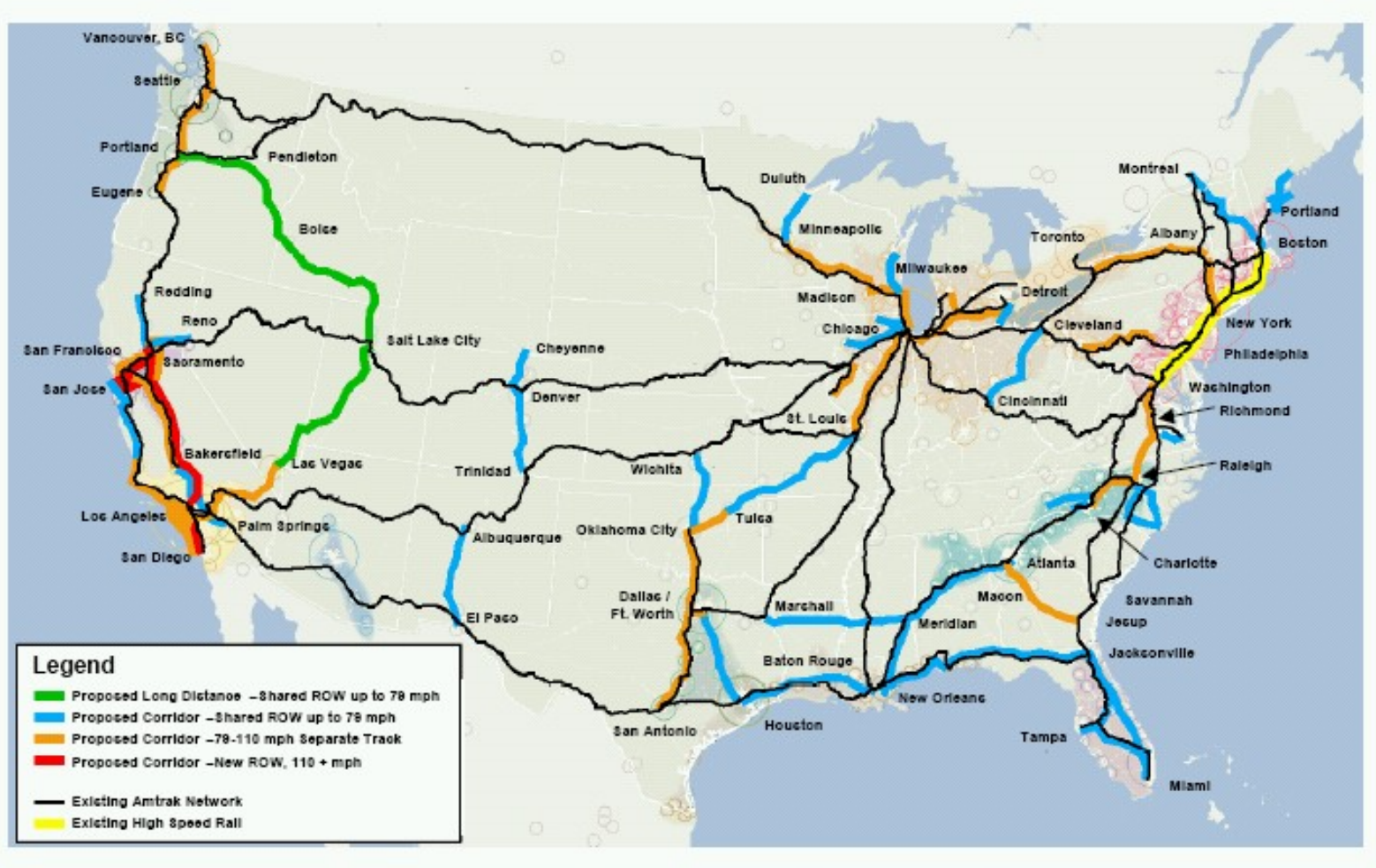
2030 PRWG Proposed Intercity Passenger Rail Network

Background map based o'America 2050: A Prospect@swww.america2050.org, Regional Plan Association