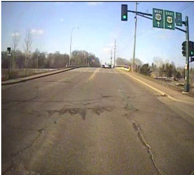
911-0 Windshield 03/25/2008 17:25:13.25 Surveillance