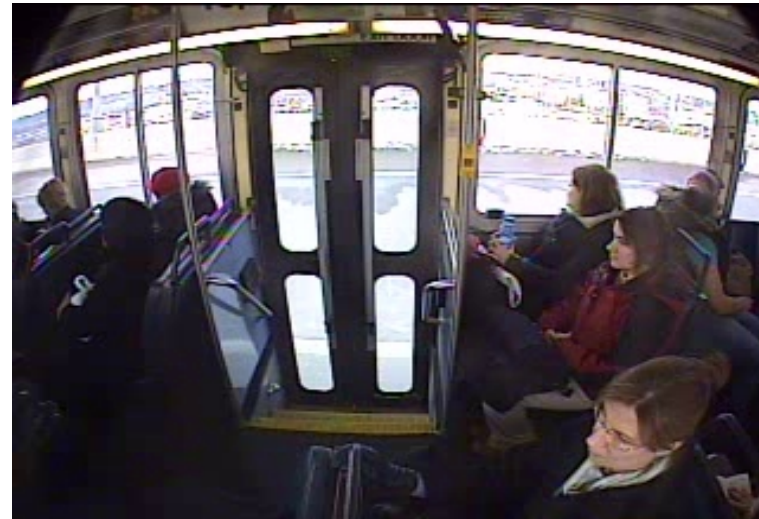
911-0 03/25/2008 17:05:10.48 Rear door surveillance