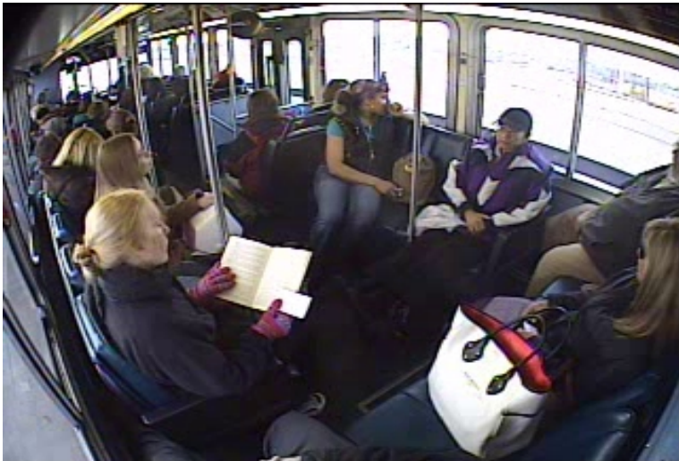
911-0 03/25/2008 17:05:05.84 Rear camera surveillance