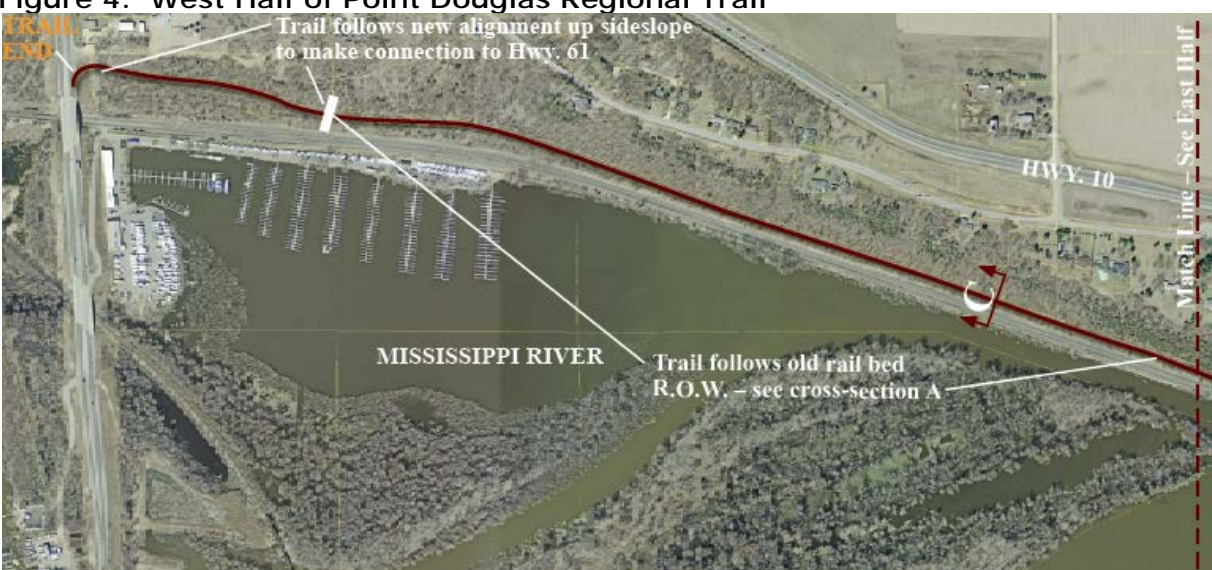
Figure 4: West Half of Point Douglas Regional Trail

Washington County currently owns much of the property needed for the regional trail, including the regional trailhead as well as the former railroad right-of-way. At the west end of the trail corridor, approximately 7 acres of land will need to be acquired to traverse the slope and make the connection to the planned trail along Highway 61, as shown in Figure 5. The tax assessed value of this property is $71,000.