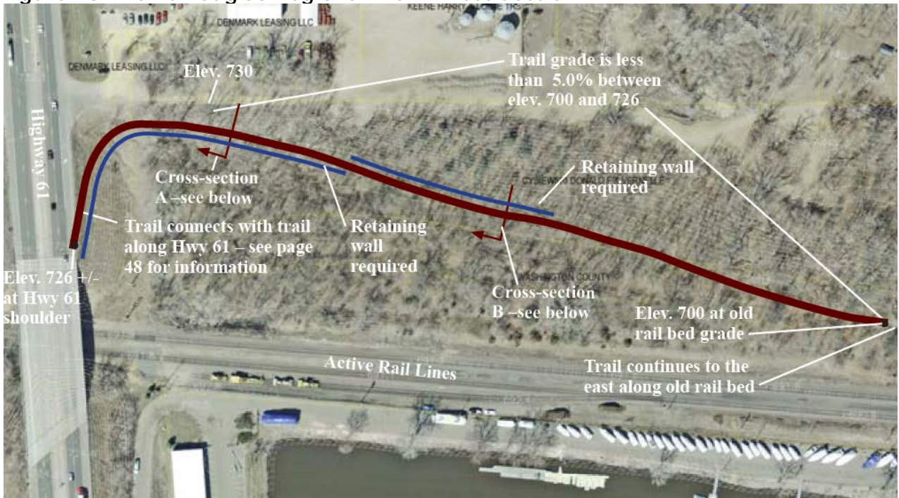
Figure 10: Point Douglas Regional Trail—West Section

Trail amenities will be concentrated at the regional trailhead on the east end of the corridor. Site amenities along the trail will be limited to select bench locations to take advantage of views of the Mississippi River. Signage and wayfinding will also be provided. The estimated development costs of both the trailhead and the regional trail are $2,583,000, as shown in Figure 11.