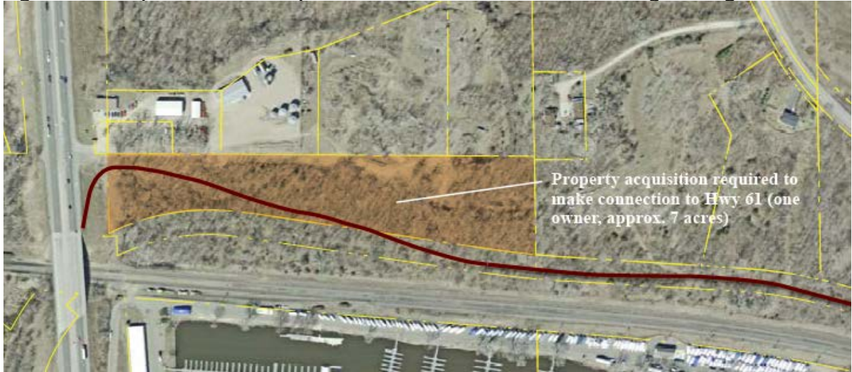
Figure 5: Proposed Land Acquisition on west end of Point Douglas Regional Trail

At the east end of the trail corridor, the acquisition of approximately 3.9 acres of land owned by the Minnesota Department of Transportation (MnDOT) is necessary, as shown in Figure 6. The master plan states that as of 2011, it is expected that the property would be transferred from MnDOT to Washington County at no cost.