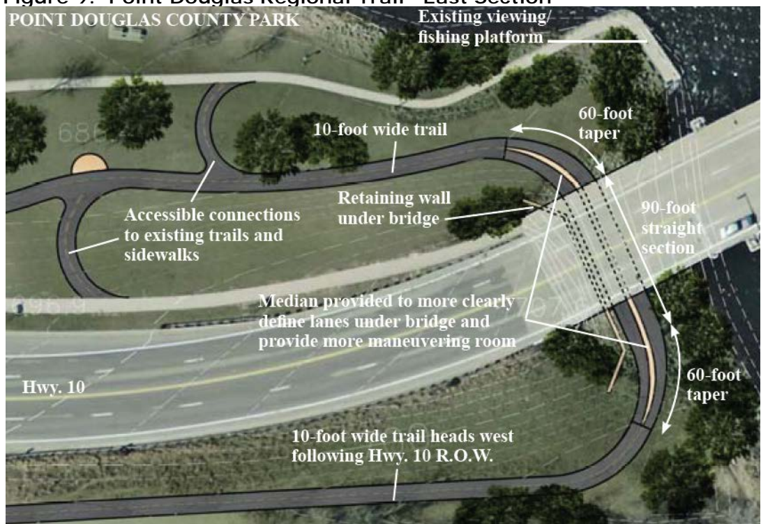
Figure 9: Point Douglas Regional Trail—East Section

Once the trail reaches the former rail bed, it travels west virtually uninterrupted for 2.5 miles until it approaches Highway 61. This portion of the trail is more visually appealing and less noisy than the segment along Highway 10. There are active rail lines to the south between the regional trail corridor and the Mississippi River; however, the tracks are at a lower elevation and are not visually distracting unless a train is passing through. The steep slopes and vegetation between the trail and the railroad tracks provide a buffer for most of the corridor. Limited grading will be needed in this area. The most important concern will be to ensure proper drainage.