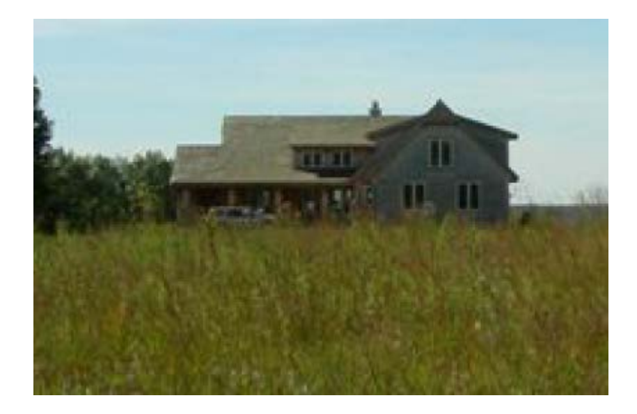
Figure 3: House and pole barns on Wells Fargo parcel

The acquisition includes a 3,955 sq. ft. 3 bedroom, 3 bath, 3 car garage home and two 40 ft. by 80 ft. pole barns as shown in Figure 3 below. These structures will initially be rented until the park is developed in the future and then reused for park purposes.