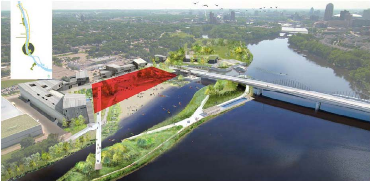
Figure 3: Artists' rendering design for Scherer Lumber Company site in Above the Falls Regional Park

The estimated cost to develop this portion of Above the Falls Regional Park is $23.3 million as shown in Table 3. It should be noted that re-creating Hall's Island accounts for $10 to $12 million of the total cost. The costs will be refined further in the updated master plan for the entire Above the Falls Regional Park and through schematic design, and permit scoping for specific projects. The updated master plan is expected to be completed in early 2013.