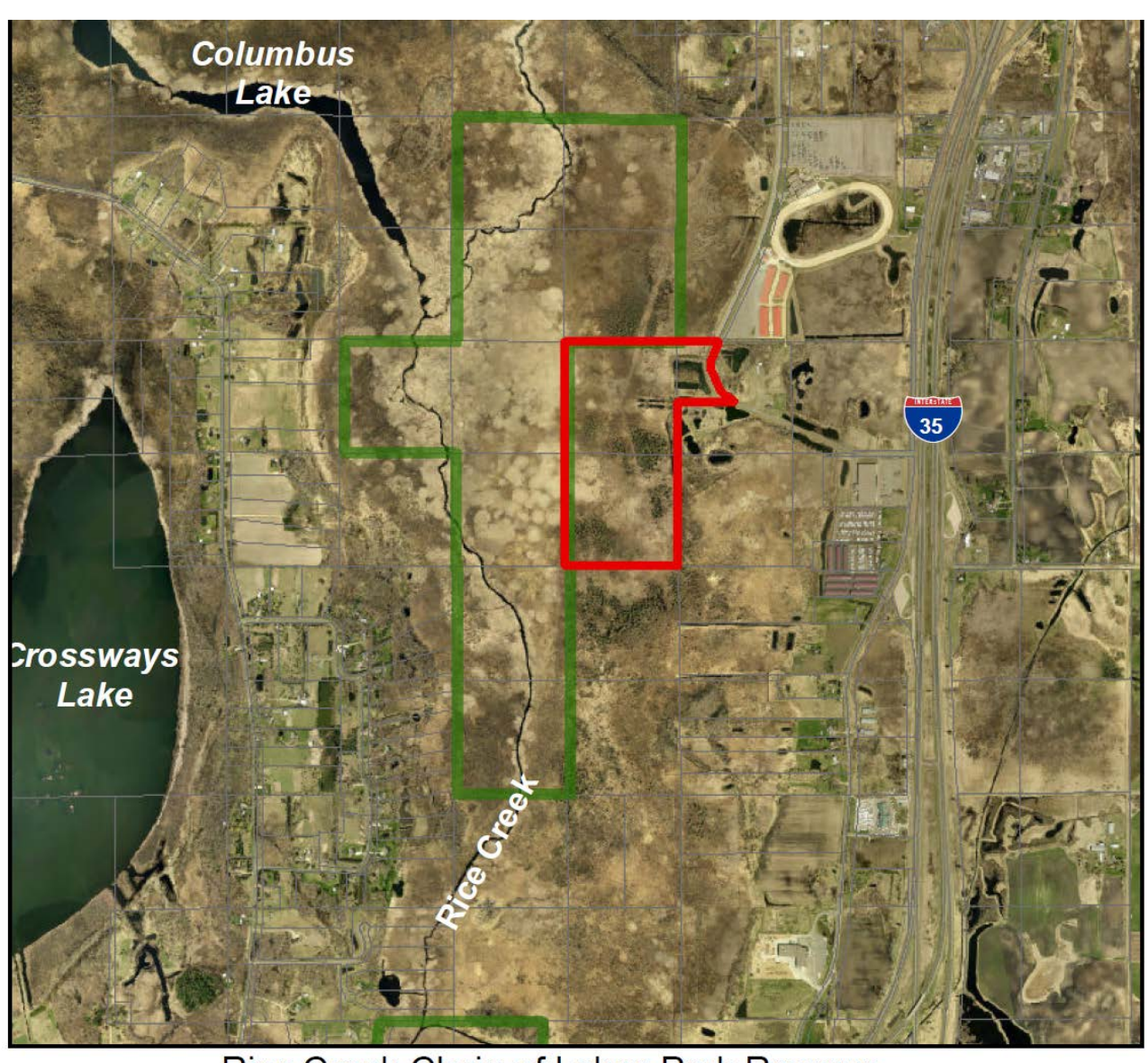
Figure 1: Aerial map of 85 acre Preiner parcel in Rice Creek Chain of Lakes Park Reserve

Rice Creek Chain of Lakes Park Reserve Proposed Land Acquisition