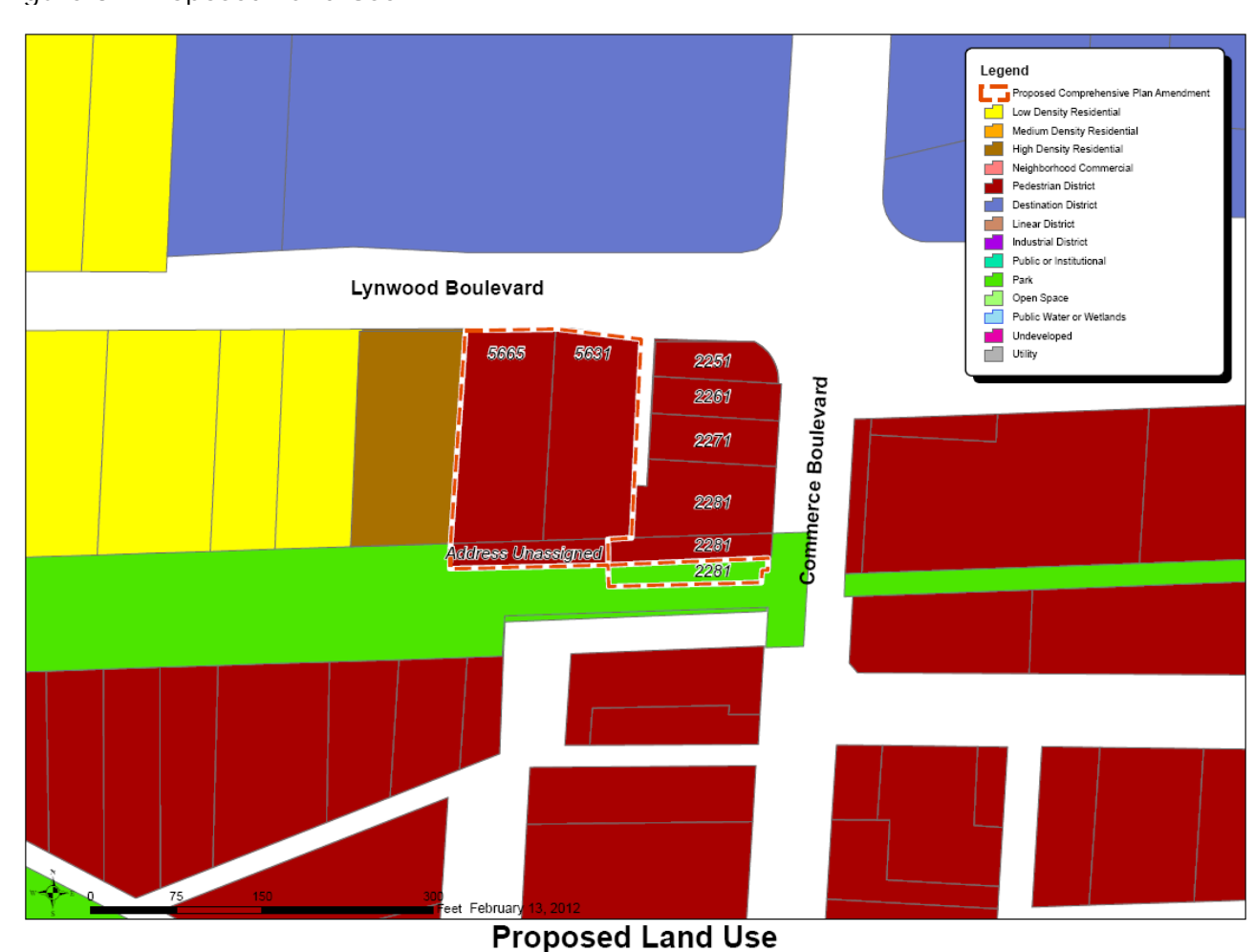
Figure 3: Proposed Land Use

Downtown Mound Lynwood/Commerce Boulevards Comprehensive Plan Amendment