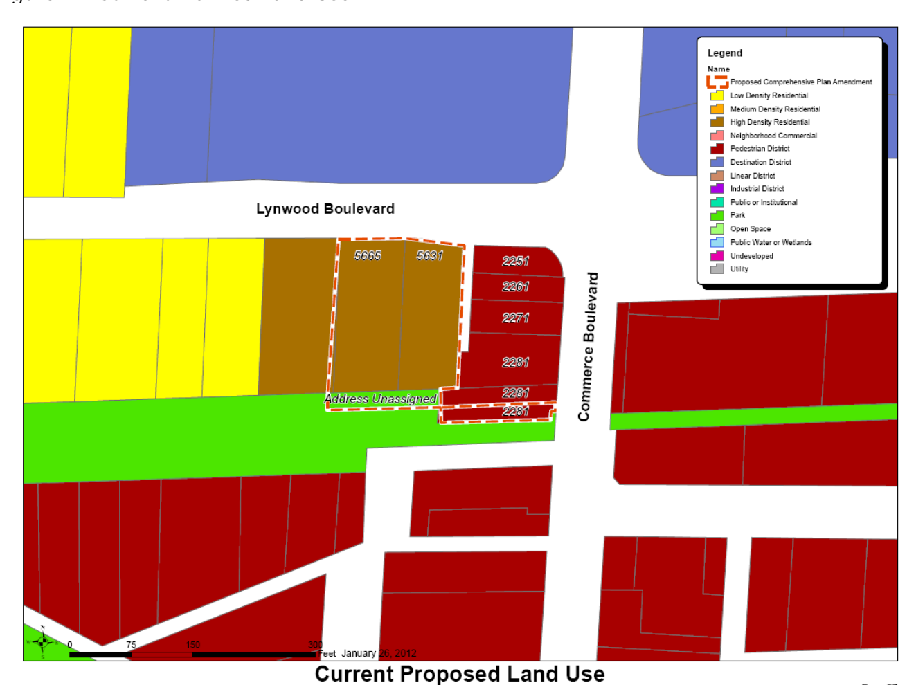
Figure 2: Current Planned Land Use

Downtown Mound Lynwood/Commerce Boulevards Comprehensive Plan Amendment