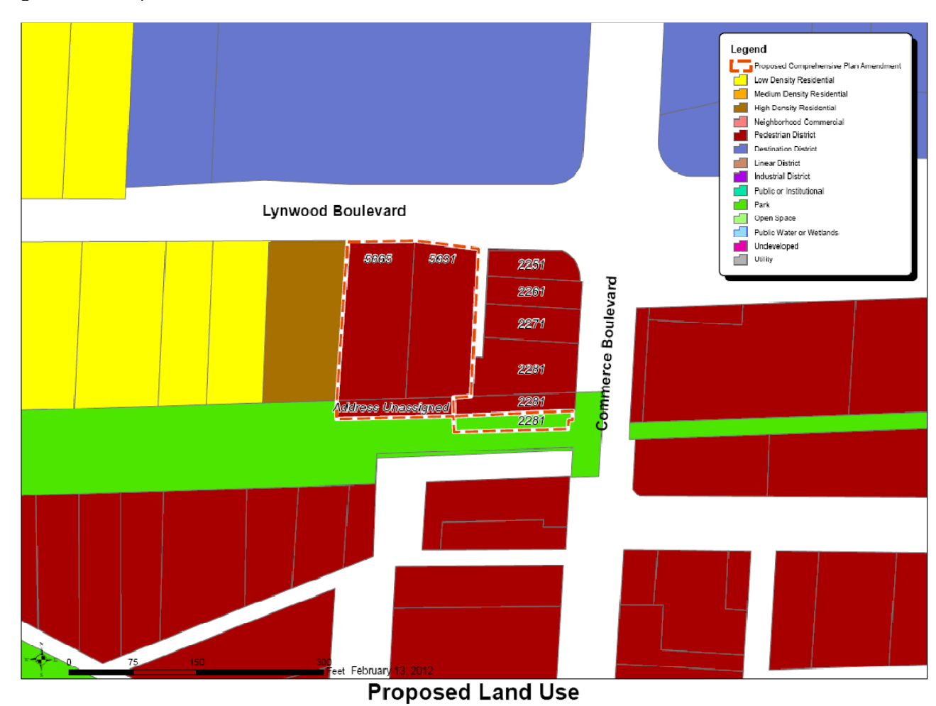
Figure 3: Proposed Land Use

Downtown Mound Lynwood/Commerce Boulevards Comprehensive Plan Amendment