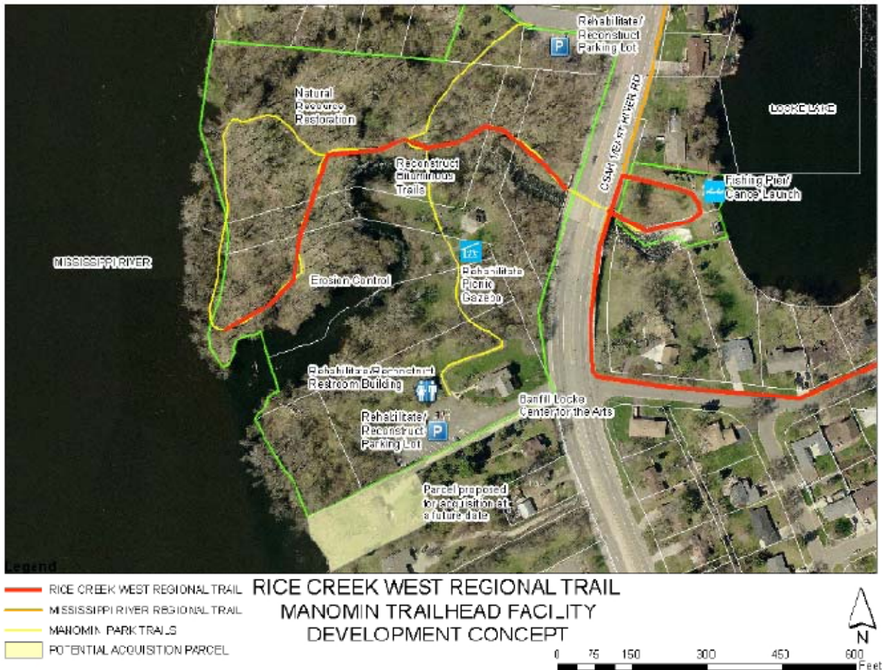
Figure 4: Manomin Trailhead Facility Development Concept

A map depicting the location of facilities and the areas of natural resource restoration is shown in Figure 4: Manomin Trailhead Facility Development Concept