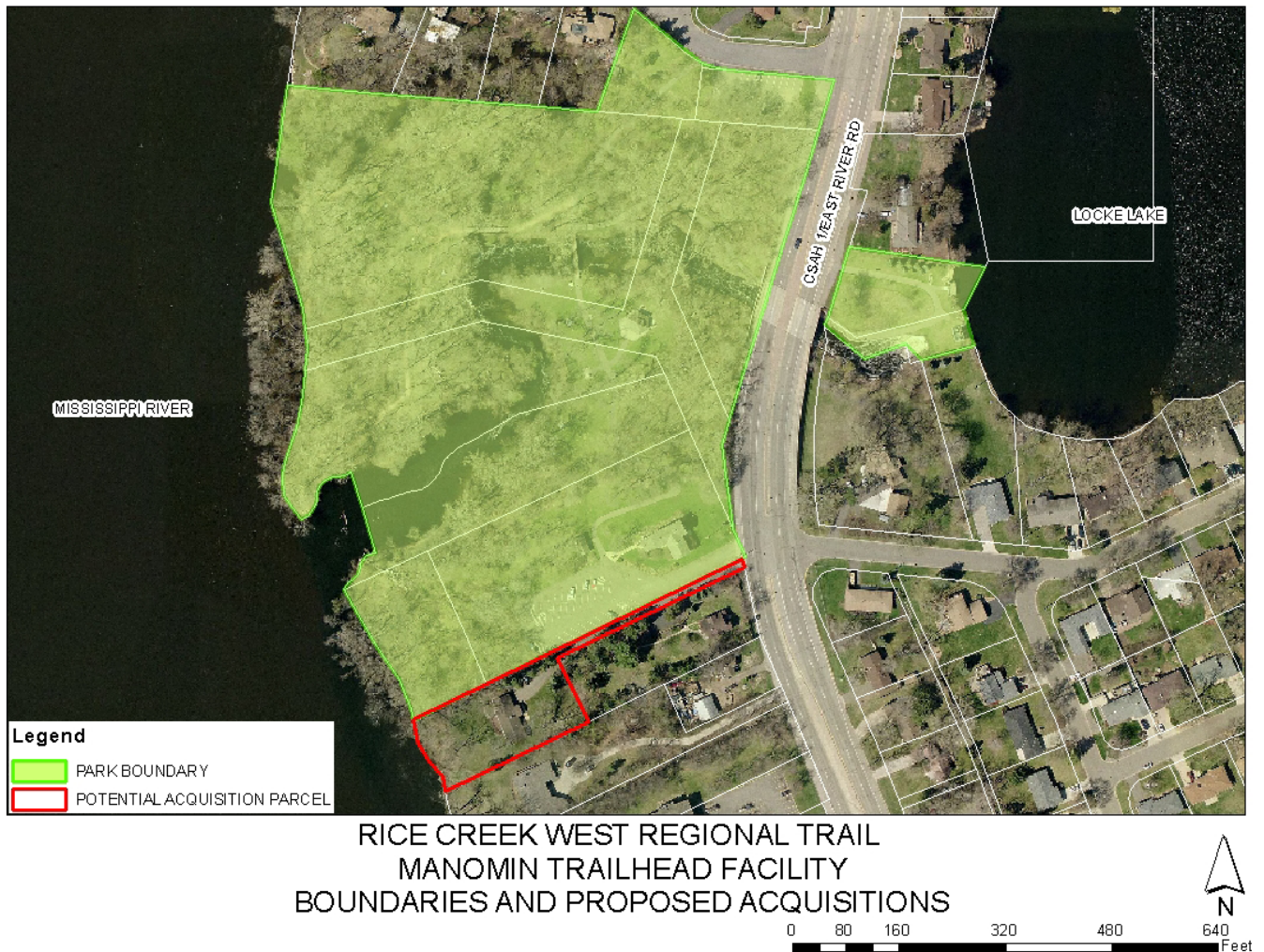
Figure 3: Manomin Trailhead Facility Boundaries and Proposed Acquisition

The parcel is proposed for acquisition because it would provide addition riverfront for the park, would provide additional space for the parking lot and entrance drives to the park and the house would be converted to office space for the Banfill Center for the Arts located in the park. Cost sharing of the acquisition with the entity that operates the art center should be done so that park funds are spent on outdoor recreation purposes.