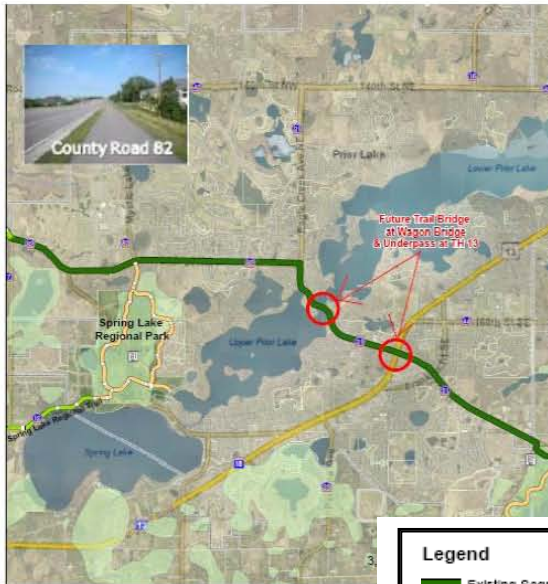
Segment 3: Spring Lake RP to Cleary Lake RP