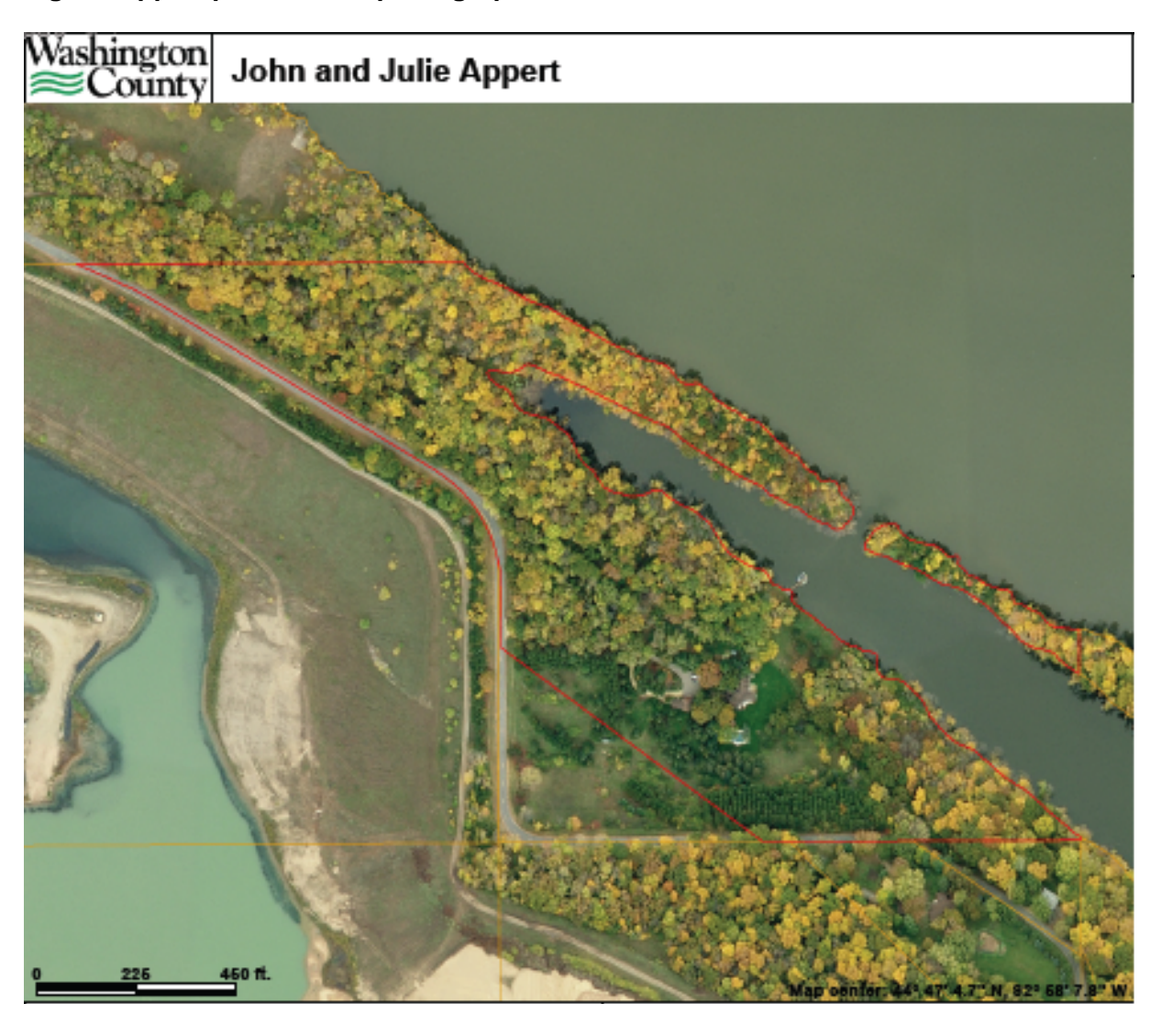
Fig. 2: Appert parcel aerial photograph

Figure 2 is an aerial photograph of the parcel (outlined in red) showing the river shoreline, home and forest cover. .