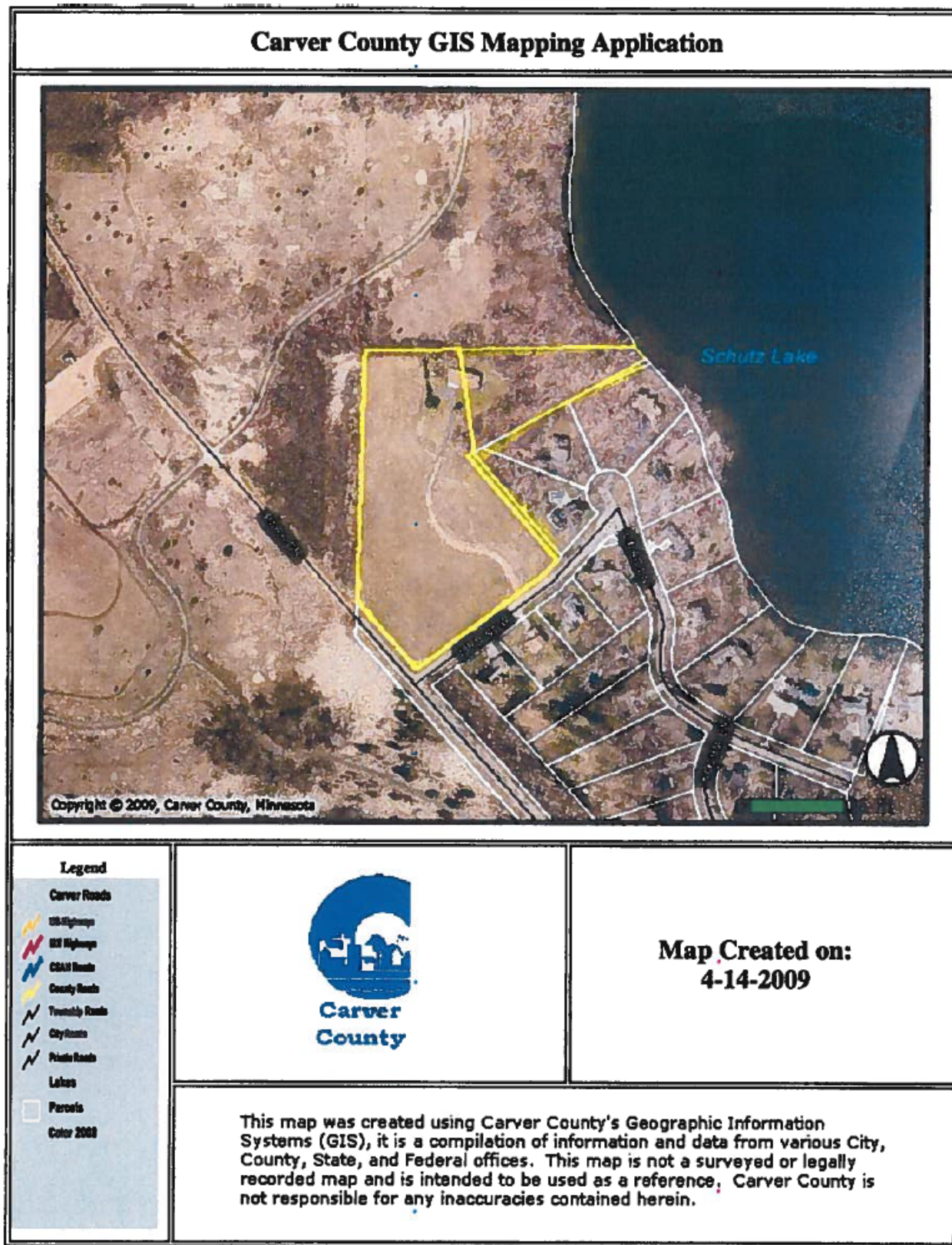
Fig. 1: Hedtke parcel proposed for acquisition at Carver Park Reserve, Three Rivers Park District