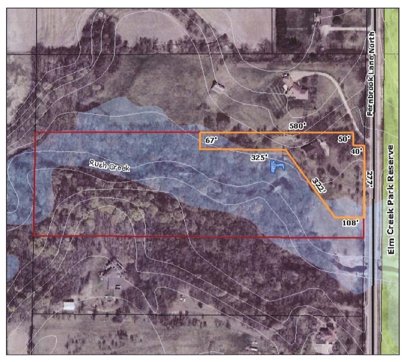
Fig. 1: Ganzer parcel proposed for acquisition at Rush Creek Regional Trail, Three Rivers Park District