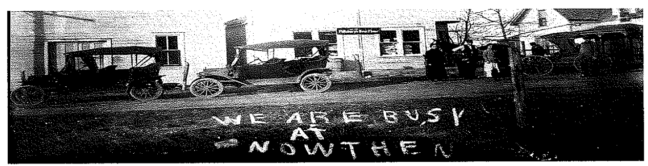
City of Nowthen • 19800 Nowthen Blvd NW • Anoka MN 55303 • 763/441-1347 • 763/441-7013 Fax