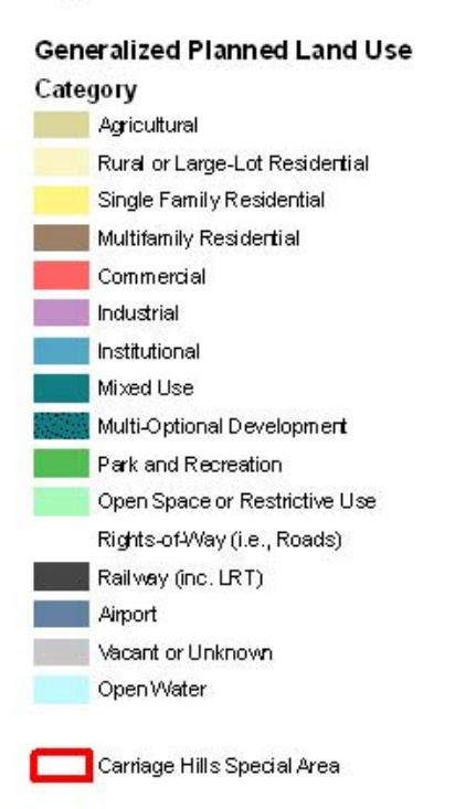
Figure 1b. Carriage Hills Special Area Proposed Land Use Change, City of Eagan