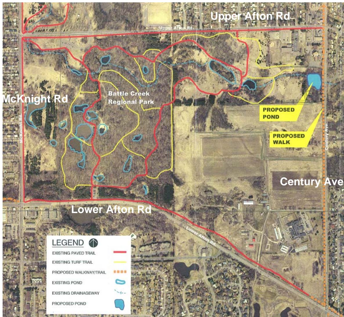
Figure 3—Aerial Photo of Proposed Pond and Sidewalk/Trail Network

Right-of-way/sidewalk easement: As part of the roadway reconstruction project, a sidewalk will be constructed along Century Avenue from Upper Afton Road to Lower Afton Road. This sidewalk will connect to the newly constructed Lower Afton Trail and to the sidewalks along Upper Afton Road. This will create a continuous pathway around the portion of Battle Creek Regional Park bounded by Upper Afton Road, Century Avenue, Lower Afton Road and McKnight Road, and will connect with the park’s internal trail system, as shown below in Figure 3.