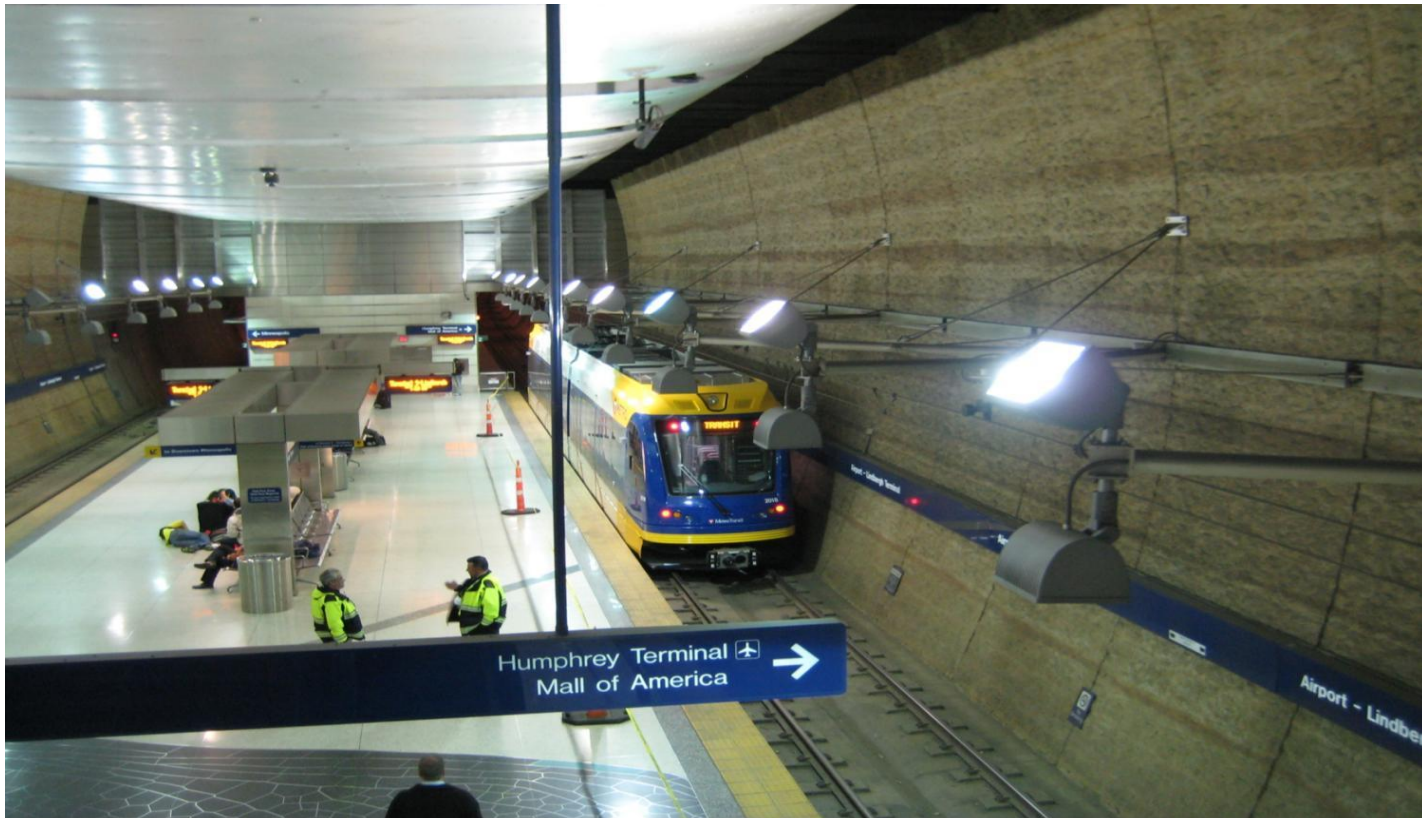
#201 Dynamic Testing in the Tunnel