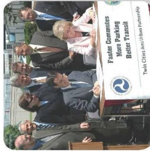
Figure 12-2: The UPA is one example of congestion management.

This Policy Plan sets a new direction and vision for the expenditure of funds on the Metropolitan Highway System emphasizing ATM applications, lower-cost / high-benefit projects and the implementation of managed lanes system-wide. It emphasizes that investments on the non-freeway trunk highway system sought by local entities should also be consistent with the policy direction of this plan. However, the Regional Solicitation for highway projects to date has to a large degree emphasized funding for expansion. This policy direction should be revisited to ensure that, in accordance with this plan and federal policy, adequate preservation investments are being made on the federally eligible highway system. The Transit chapter also emphasizes system preservation as the top priority, with additional revenue (when available) used to expand the bus system and grow the system of bus and rail