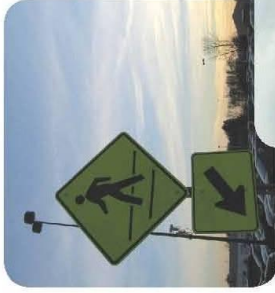
Figure 12-1: Non-motorized travel modes will play an important role in the region.

This project includes an inventory of existing and currently planned bicycle facilities in the seven county Twin Cities metropolitan area, followed by a Regional Bicycle System Master Study that will include